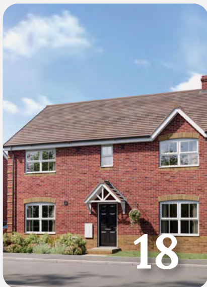
4 bedroom homes