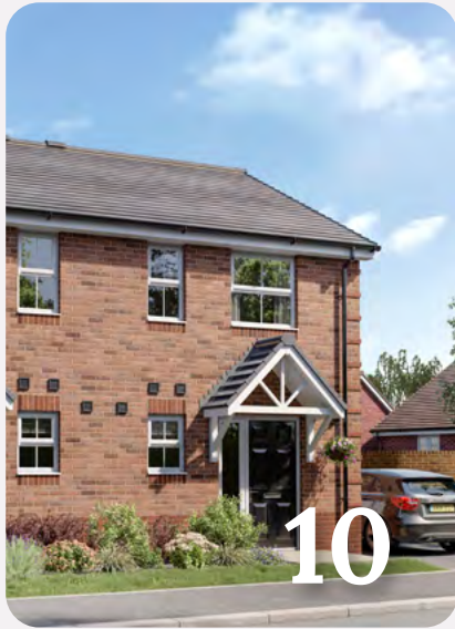
1 bedroom homes