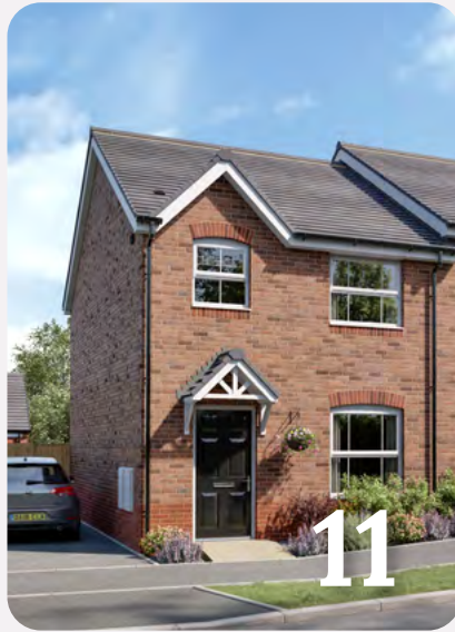
2 bedroom homes