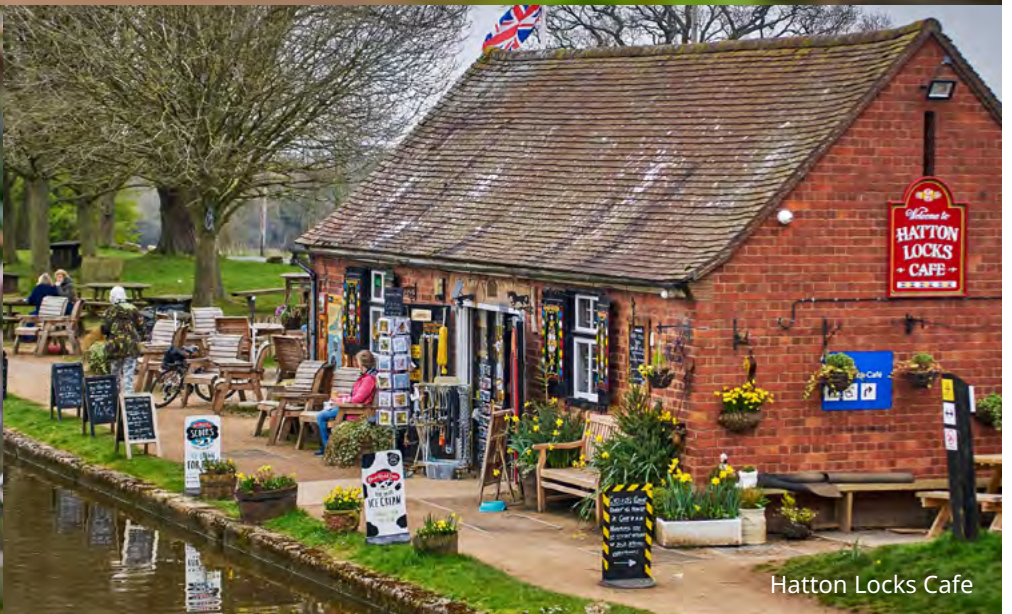
Hatton Locks Cafe