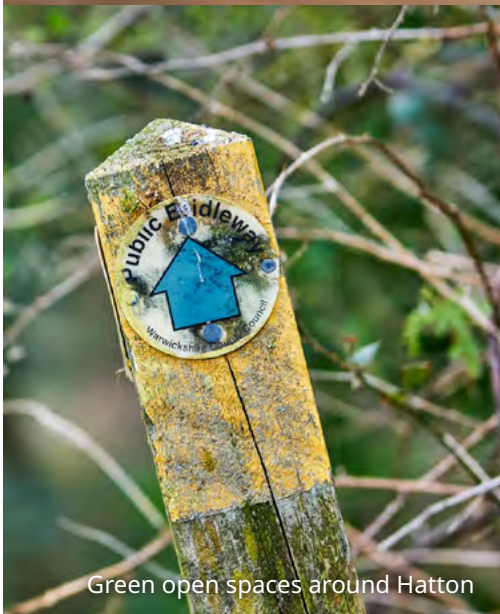
Green open spaces around Hatton