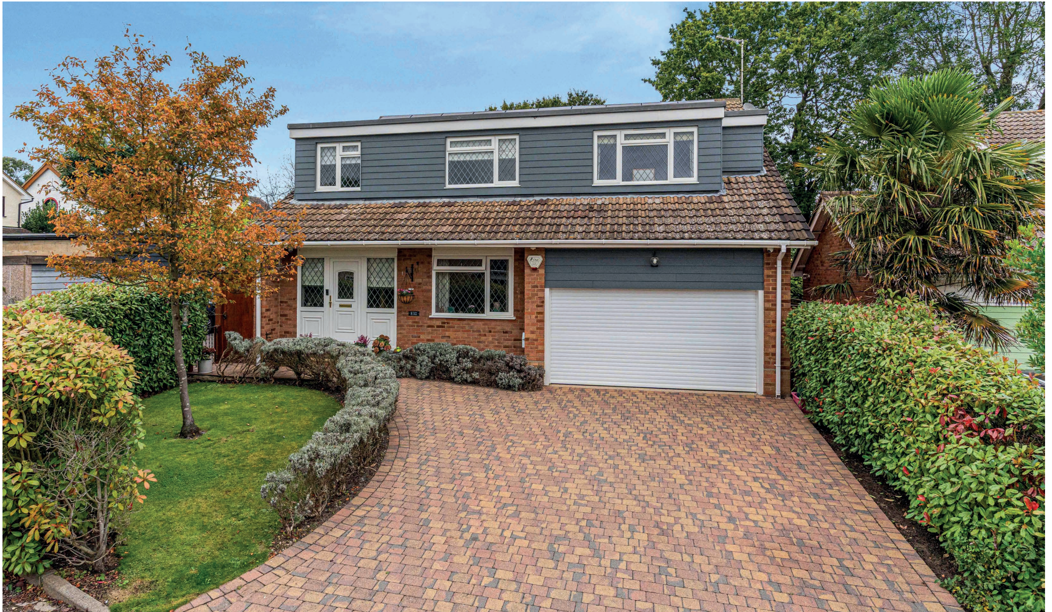
8 Tudor Close Shenfield | Brentwood | CM15 8RD