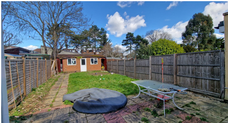
Eli-G Estates are pleased to bring to market this good size family home in a highly sought after location & offered chain free

Good size 4 Bedroom semi, Ground Floor extended, Through dining room Lounge, Great size Kitchen / morning room area, Front room / office, Guest wc, Two good size doubles, one small double & one single bedroom, Family bathroom, Out house, external storage, Large Garden, Off Street Parking, Chain Free, Viewing highly recommended get in touch with joint sole agent Eli-G Estates