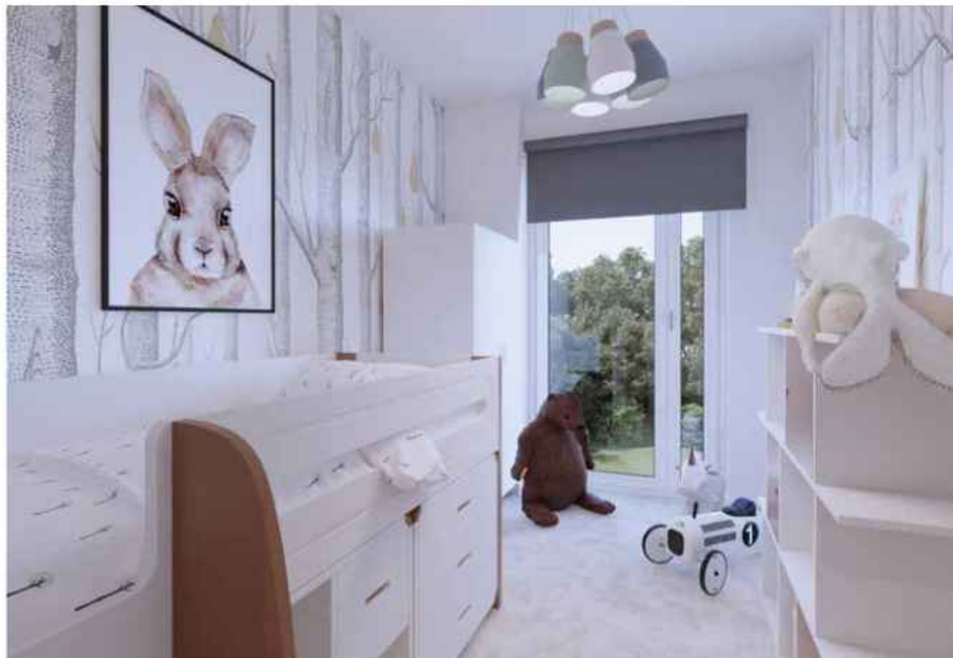
TYPE AA9 / Two bedroom apartment. Computer generated image is indicative only.