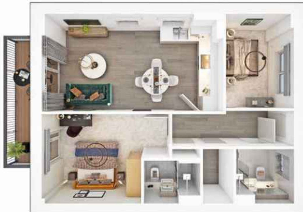
TYPE CA30 / Two bedroom apartment. Computer generated image is indicative only.