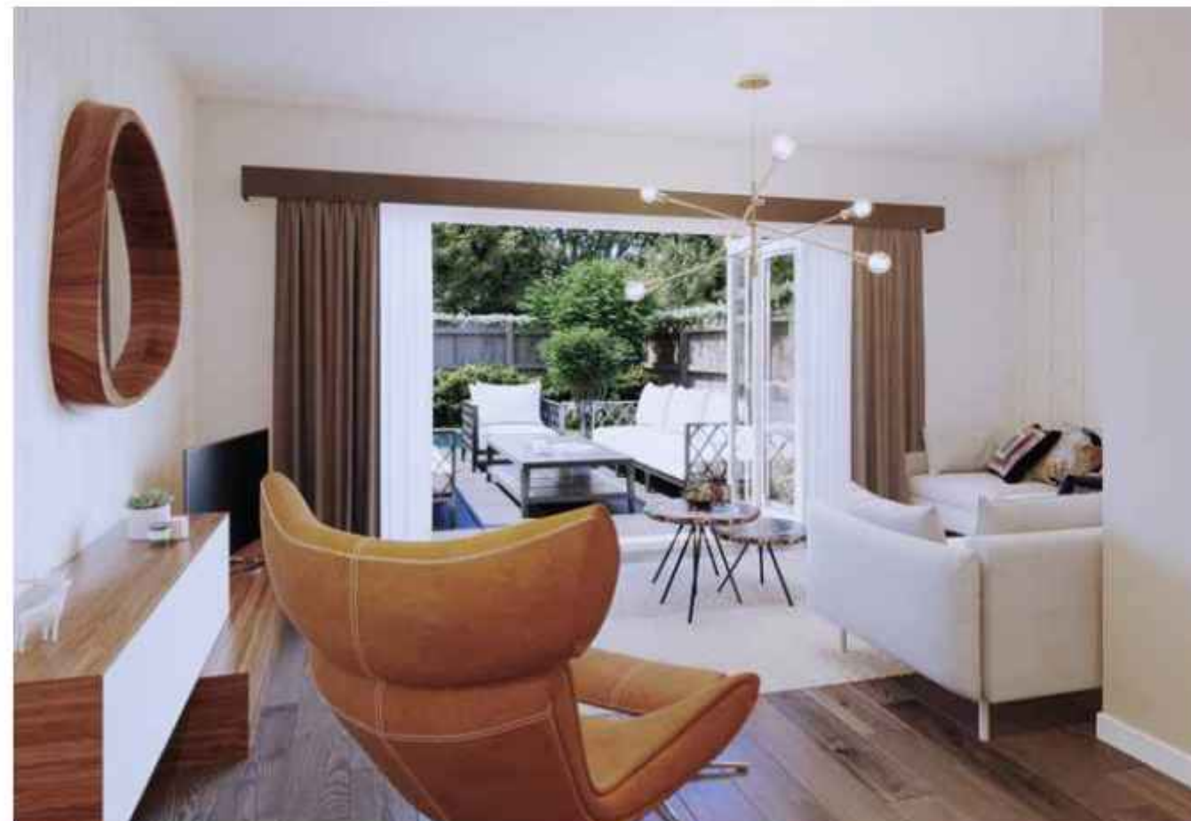
TYPE RO2 / Four bedroom house. Computer generated image is indicative only.