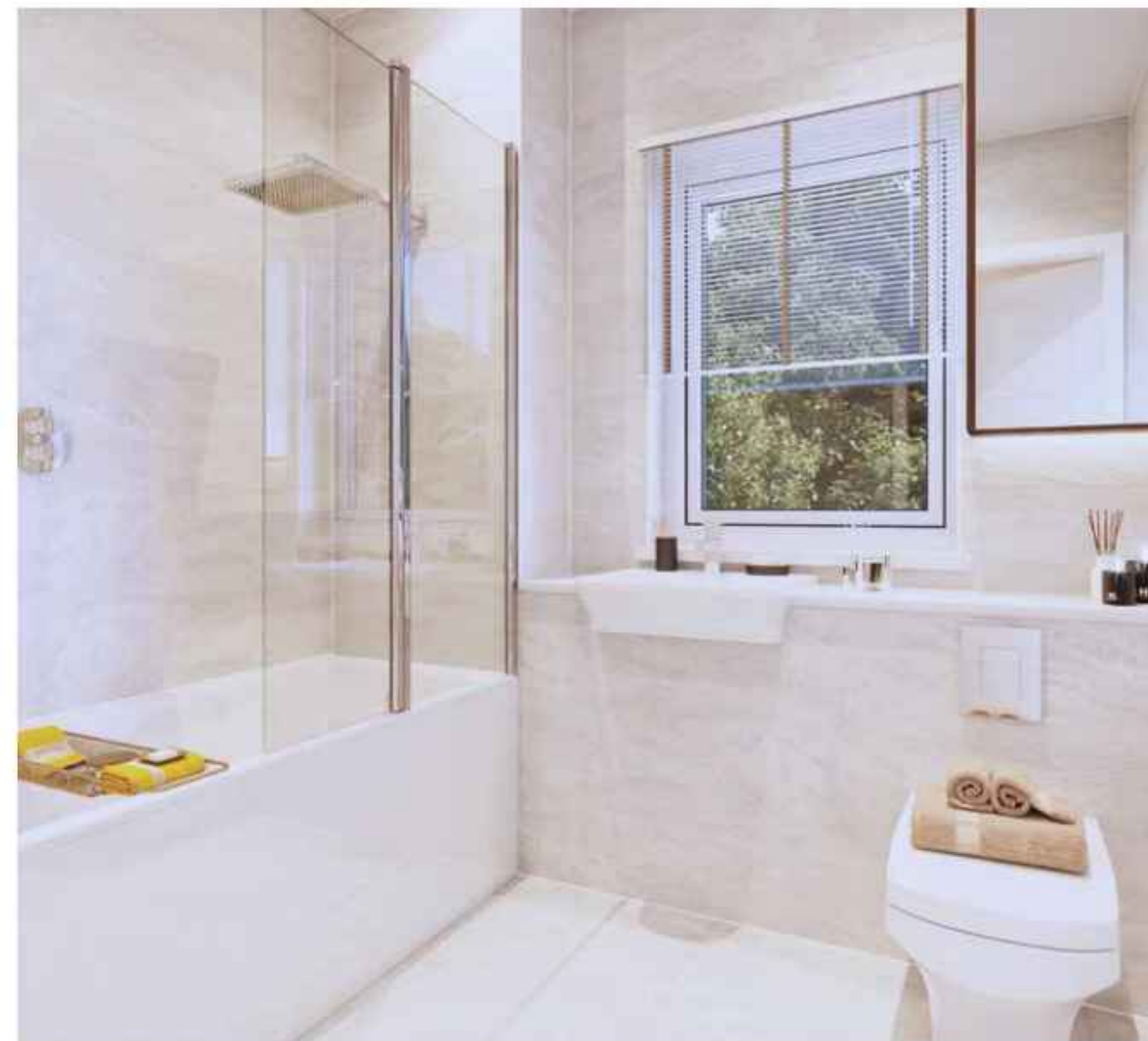
TYPE RO2 / Four bedroom house. Computer generated image is indicative only.