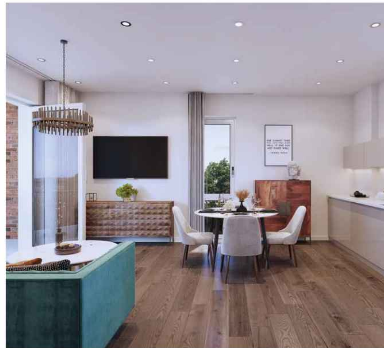
TYPE AA15 / Two bedroom apartment. Computer generated image is indicative only.