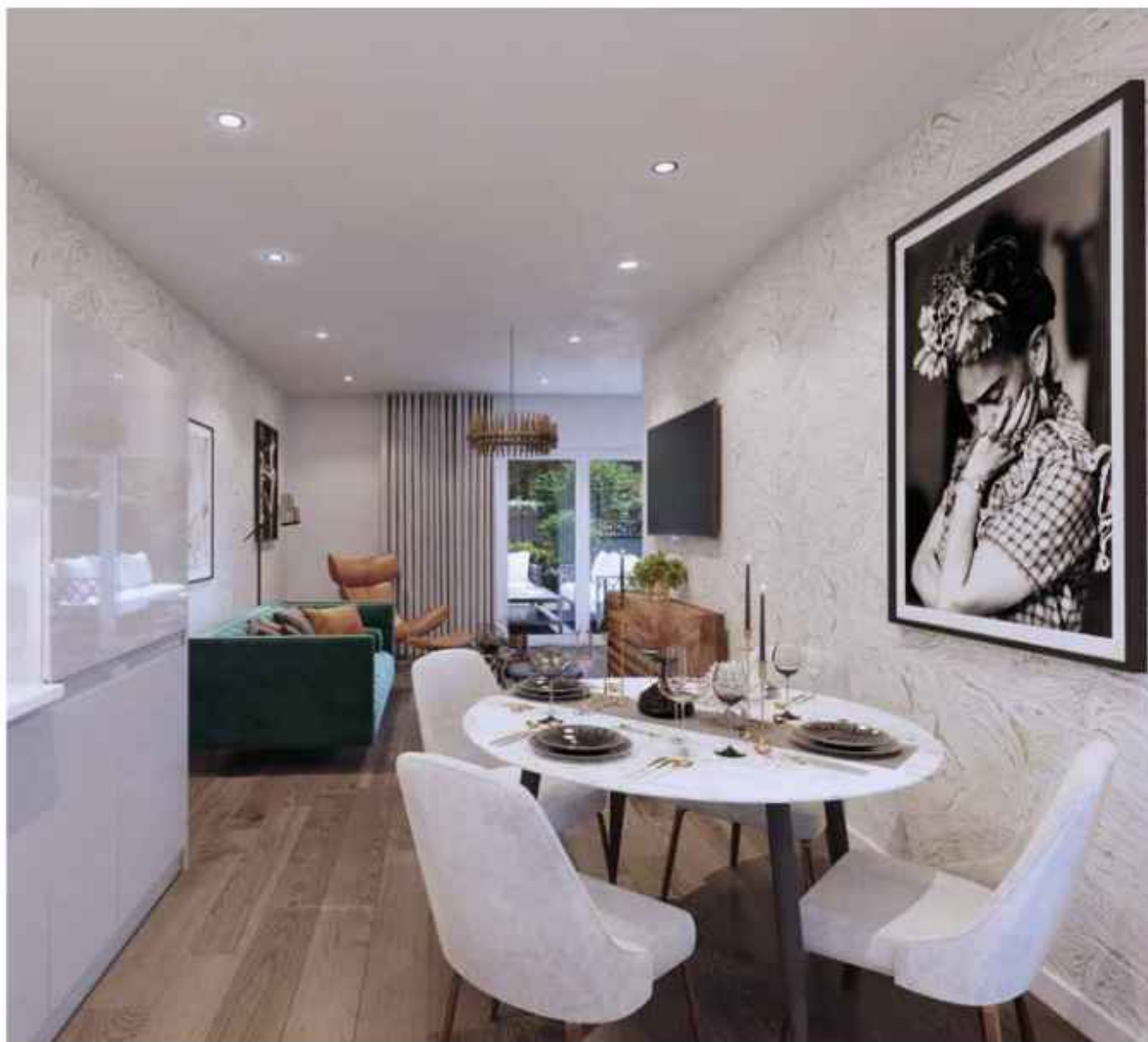
TYPE TB1 / Three bedroom house. Computer generated image is indicative only.