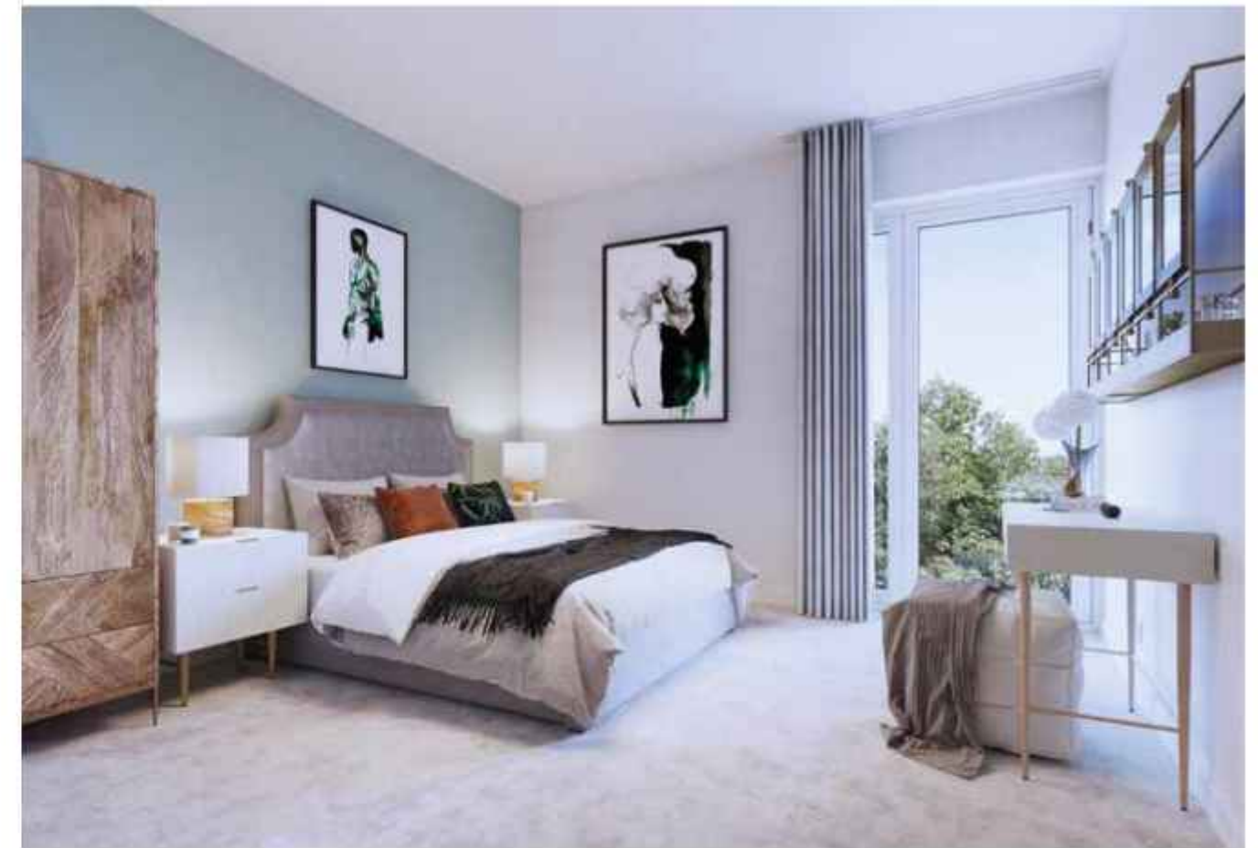
TYPE A15 / Two bedroom apartment. Computer generated image is indicative only.