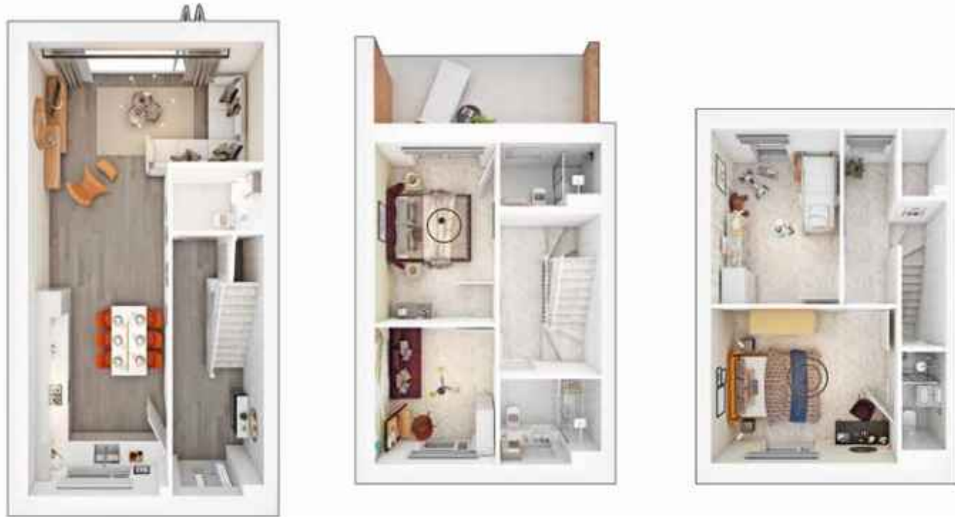
TYPE RO2 / Four bedroom house. Computer generated image is indicative only.