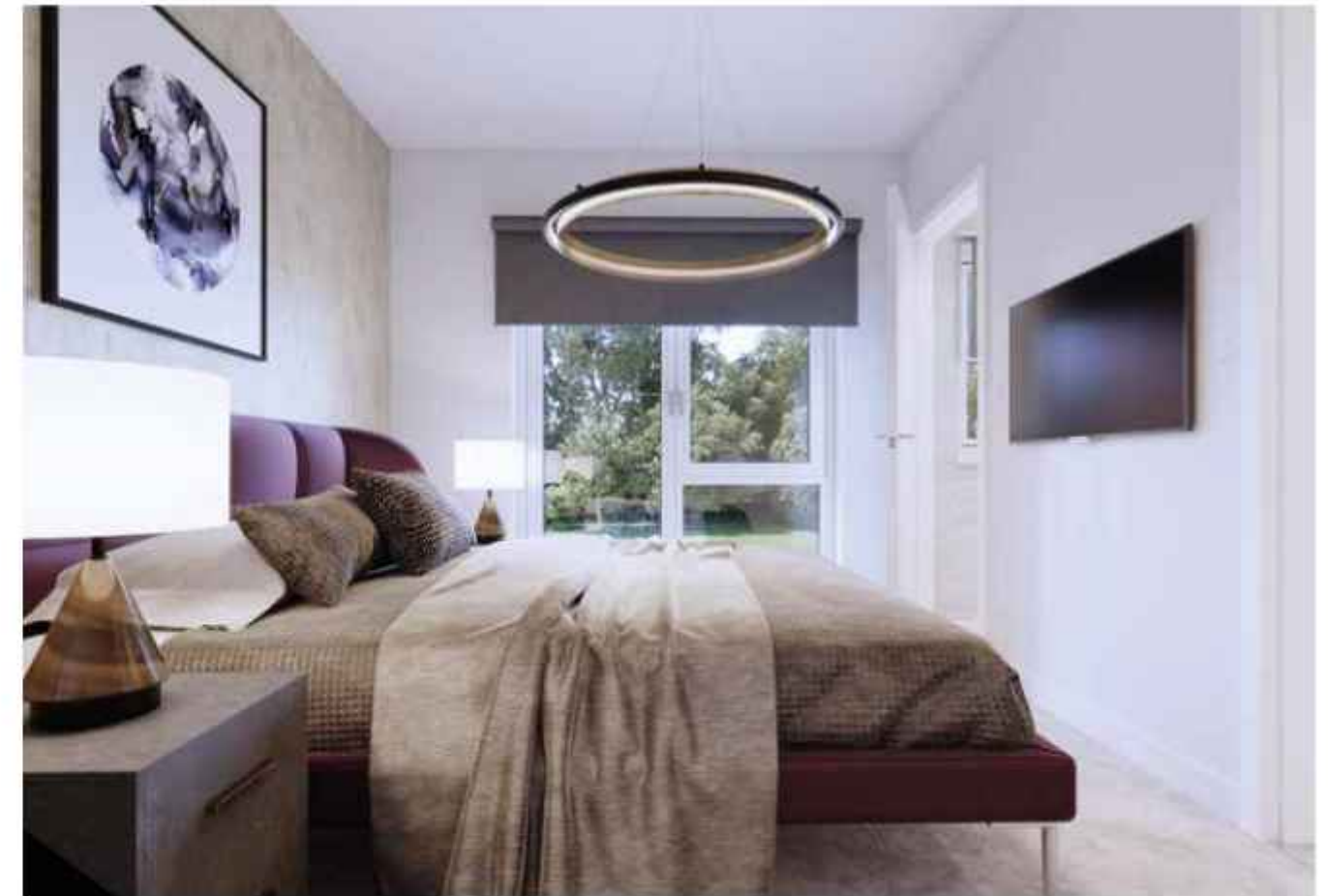
TYPE RO2 / Four bedroom house. Computer generated image is indicative only.