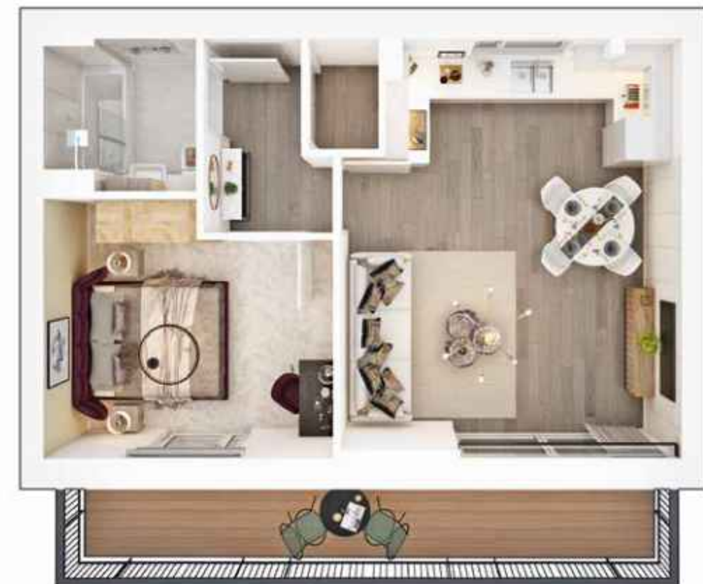
TYPE AA5 / One bedroom apartment. Computer generated image is indicative only.