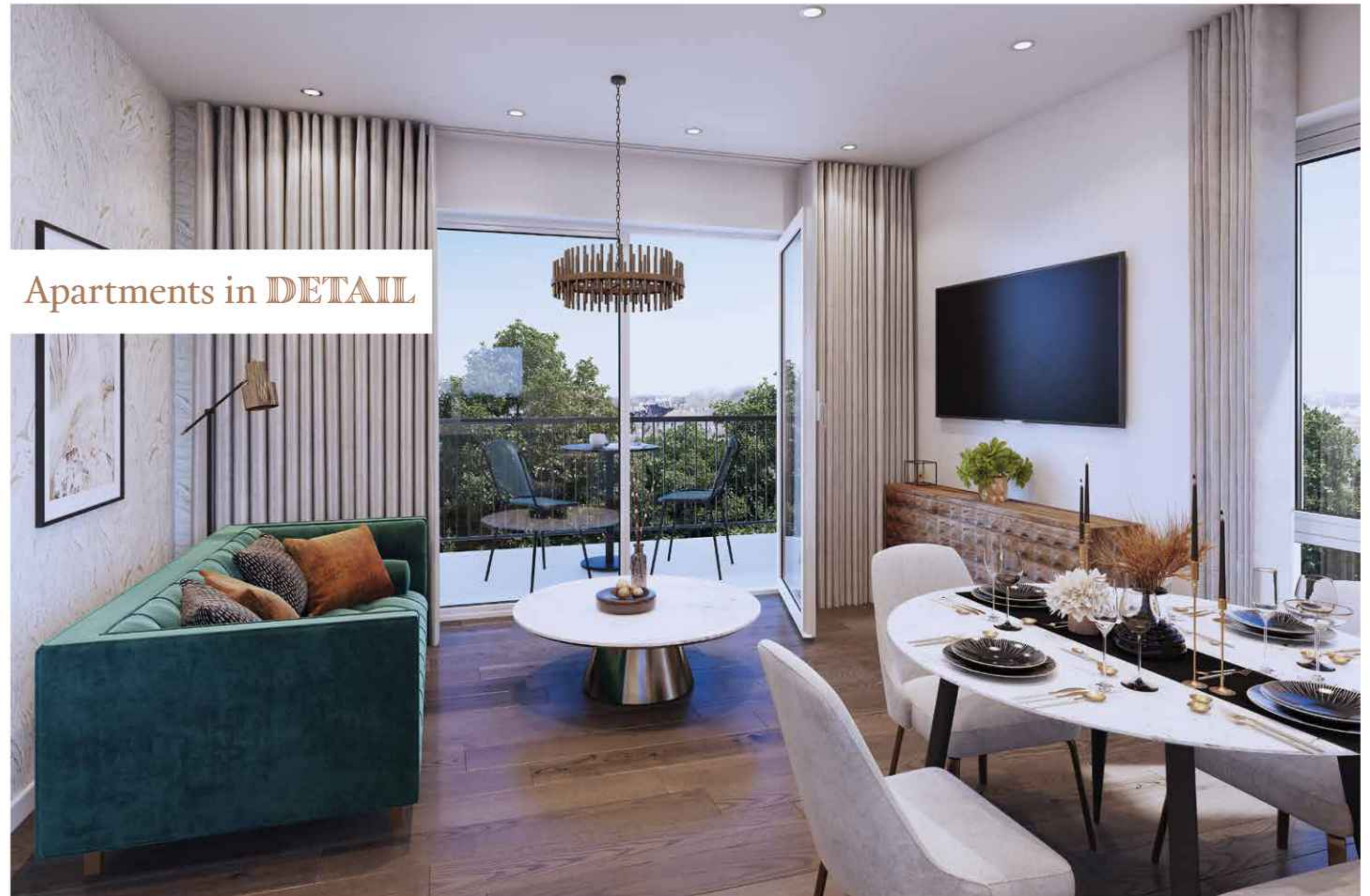
TYPE AA18 / Two bedroom Apartment. Computer generated image is indicative only.