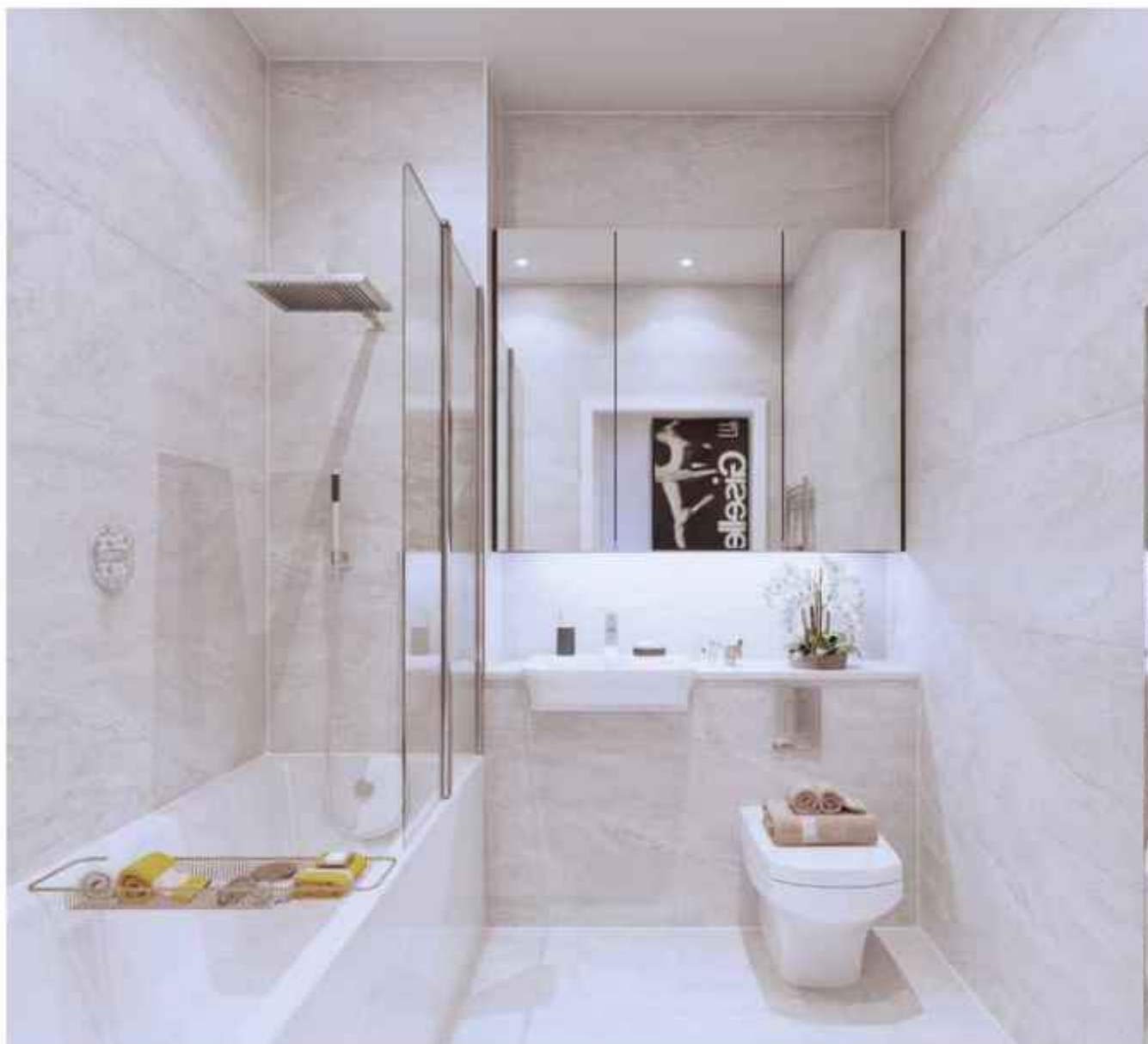
TYPE CA36 / One bedroom apartment. Computer generated image is indicative only.