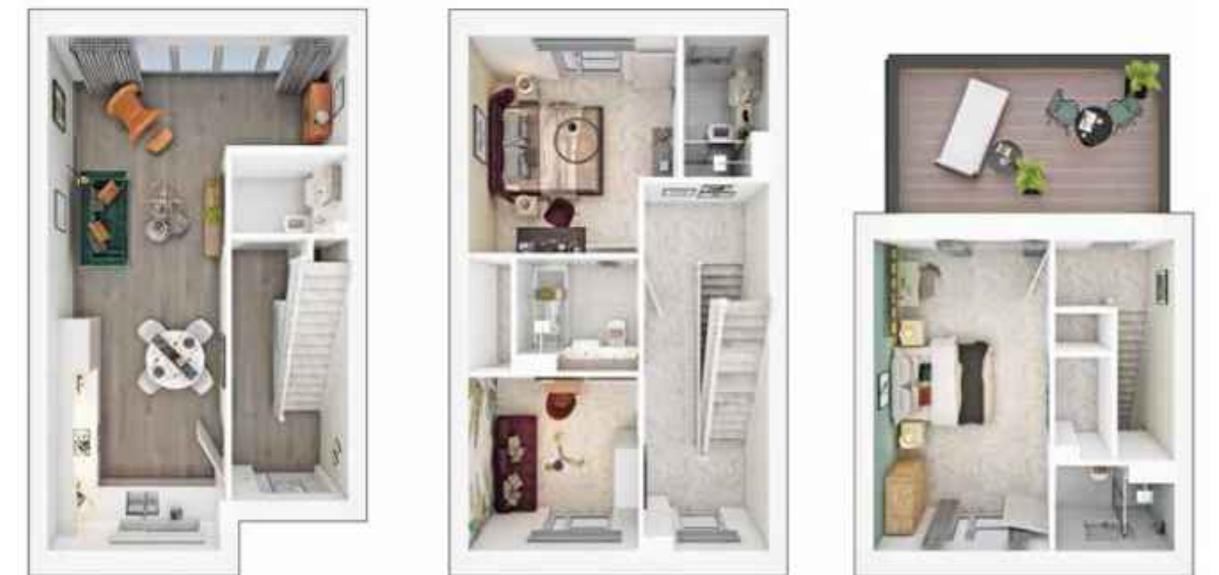
TYPE TB1 / Three bedroom house. Computer generated image is indicative only.