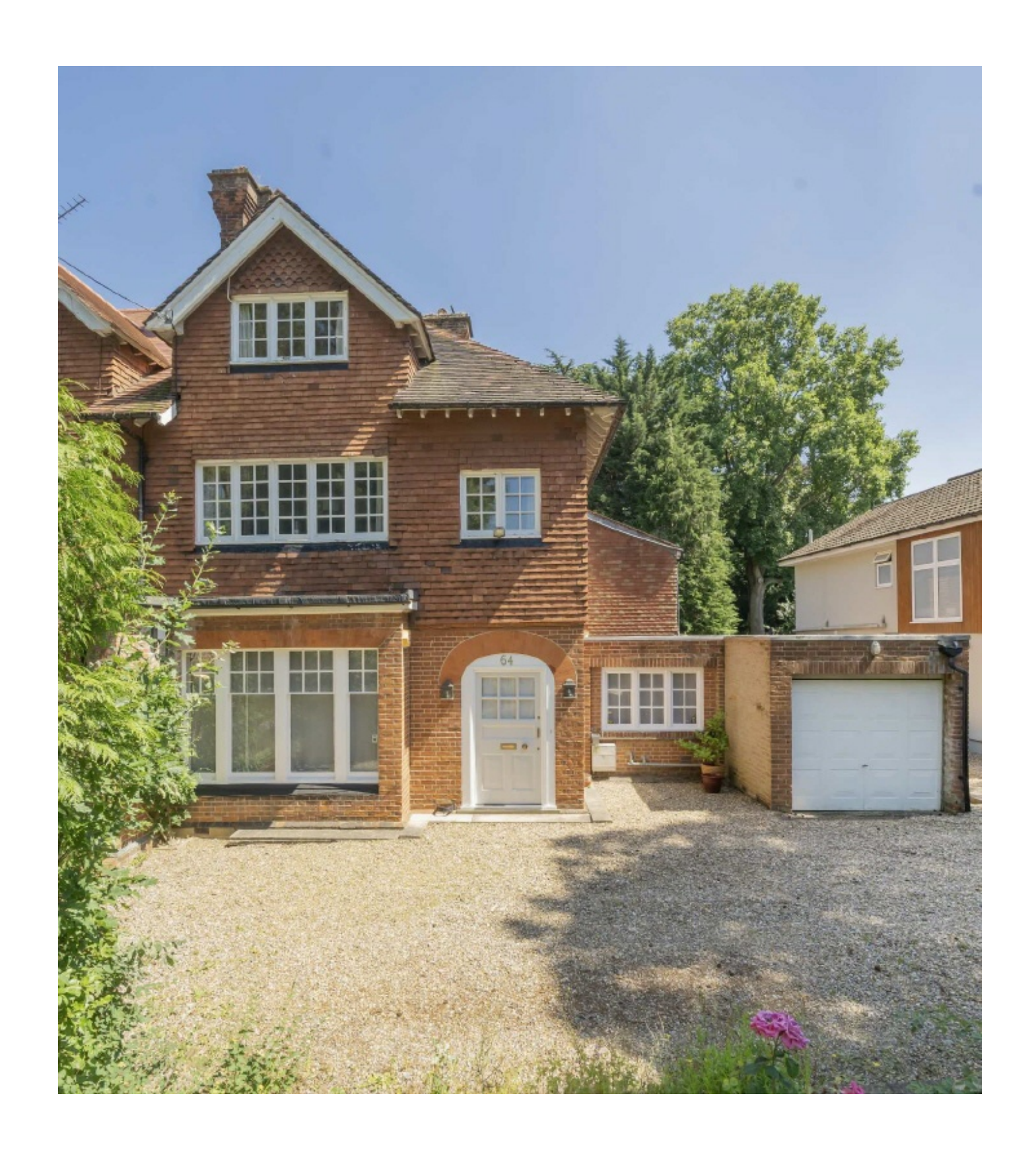
Oakleigh Park North, N20 £2,100,000