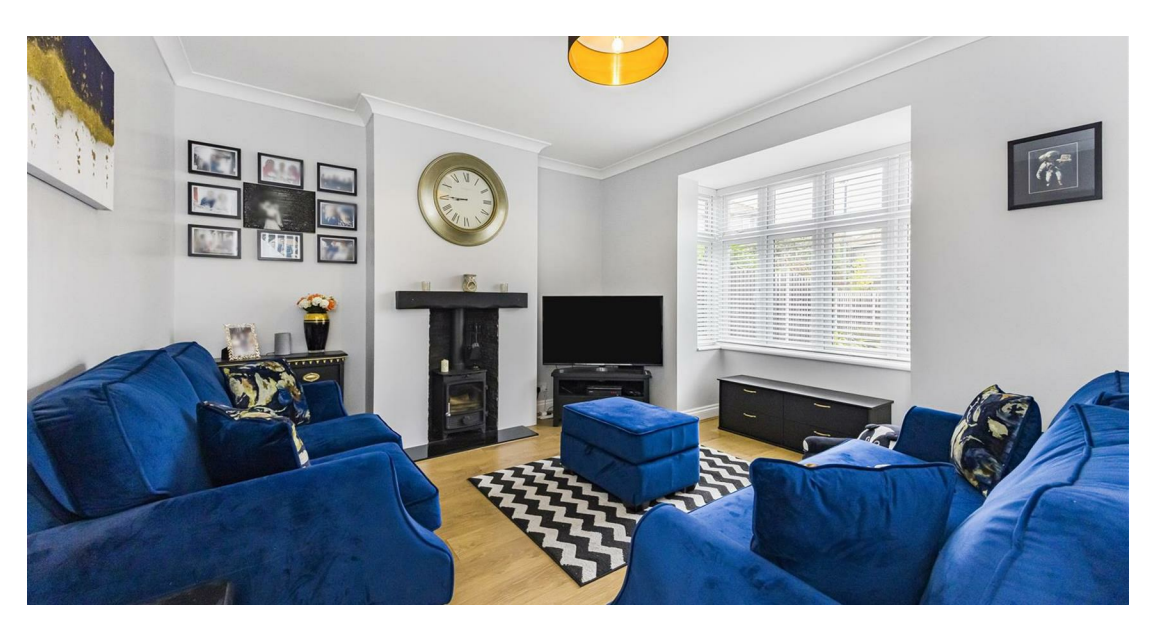
OPEN HOUSE SATURDAY 14TH JUNE- 10.00am-11.30am