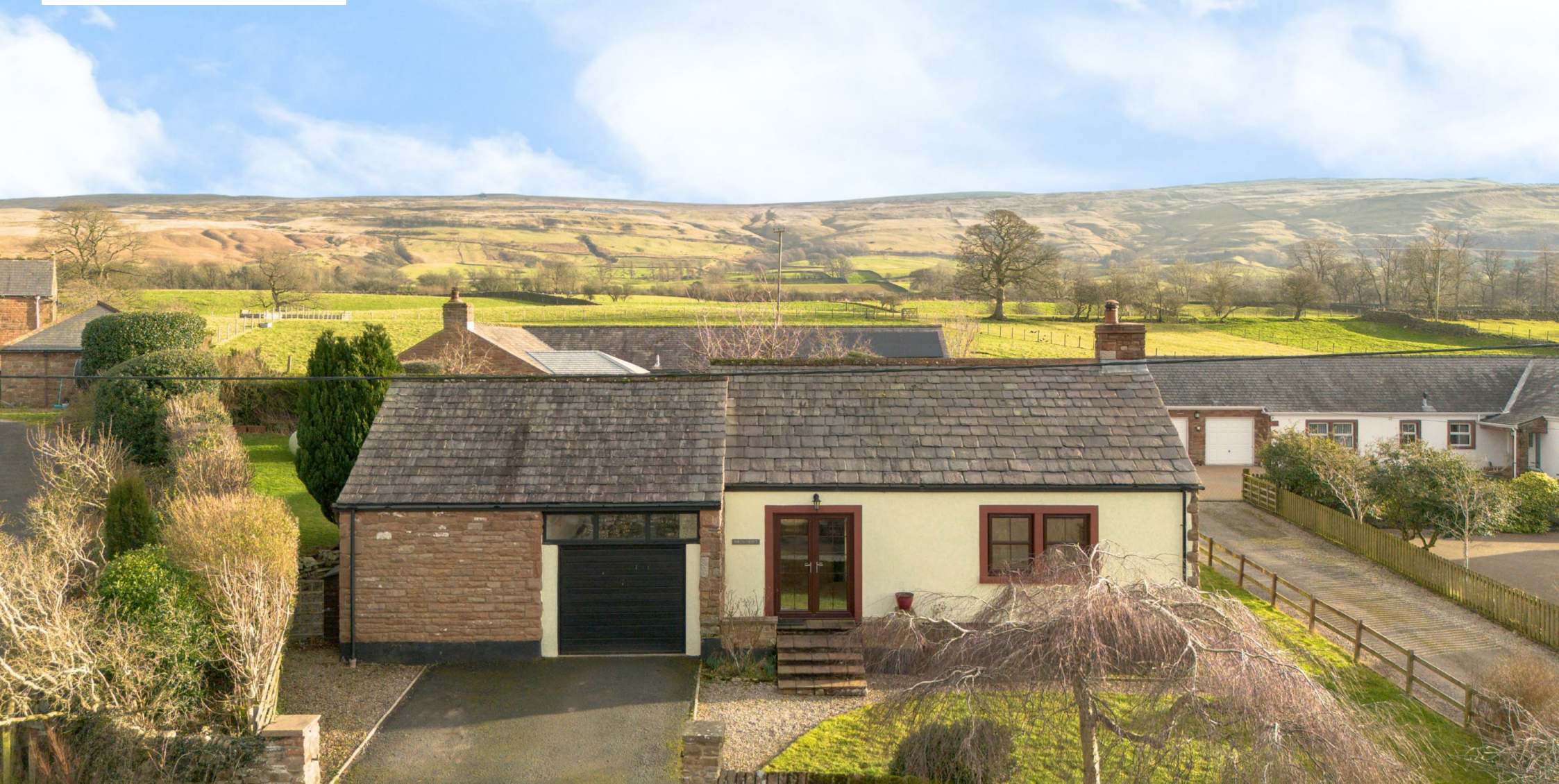
Birch Croft , Penrith, CA10 1HY