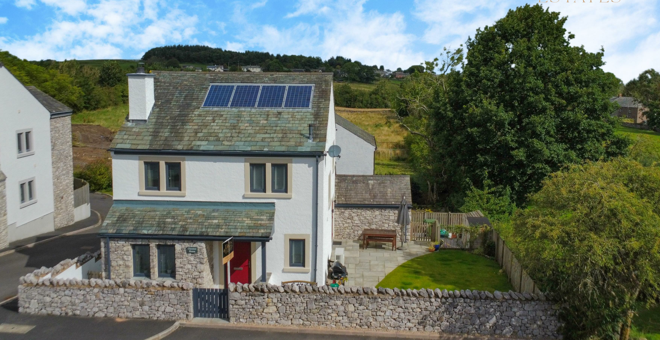
Chestnut House , Penrith, CA11 0QU