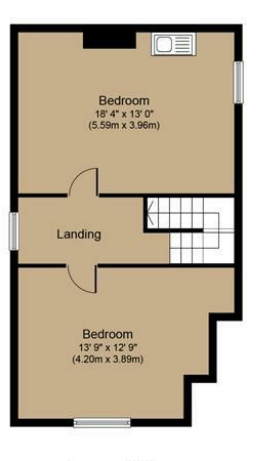
Second Floor Approximate Floor Area 564 sq. ft. (52.4 sq. m.)

Whilst every attempt has been made to ensure the accuracy of the floorplan contained here, measurements of doors, windows, rooms and any other items are approximate and no responsibility is taken for any error, omission or misstatement. This plan is for illustrative purposes only and should be used as such by any prospective purchaser. The services, systems and appliances shown have not been tested and no guarantee as to their operability or efficiency can be given.