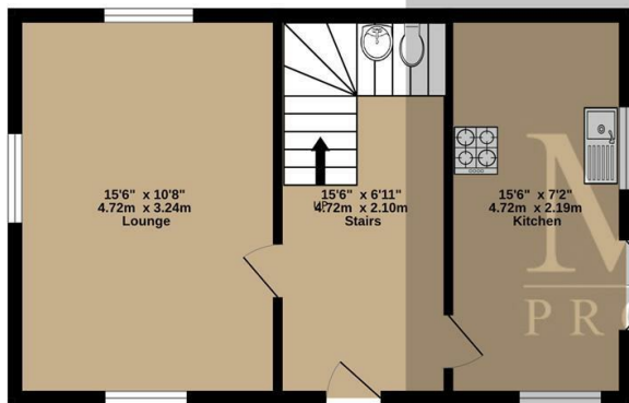
GROUND FLOOR 383 sq.ft. (35.6 sq.m.) approx.