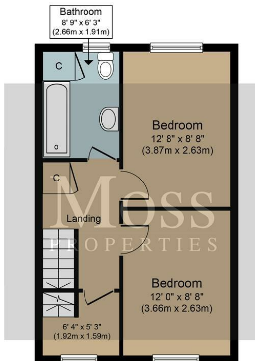
First Floor Approximate Floor Area 395 sq.ft. (36.7 sq.m.)