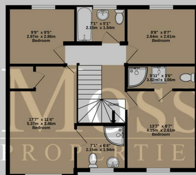
1ST FLOOR 584 sq.ft. (54.2 sq.m.) approx.