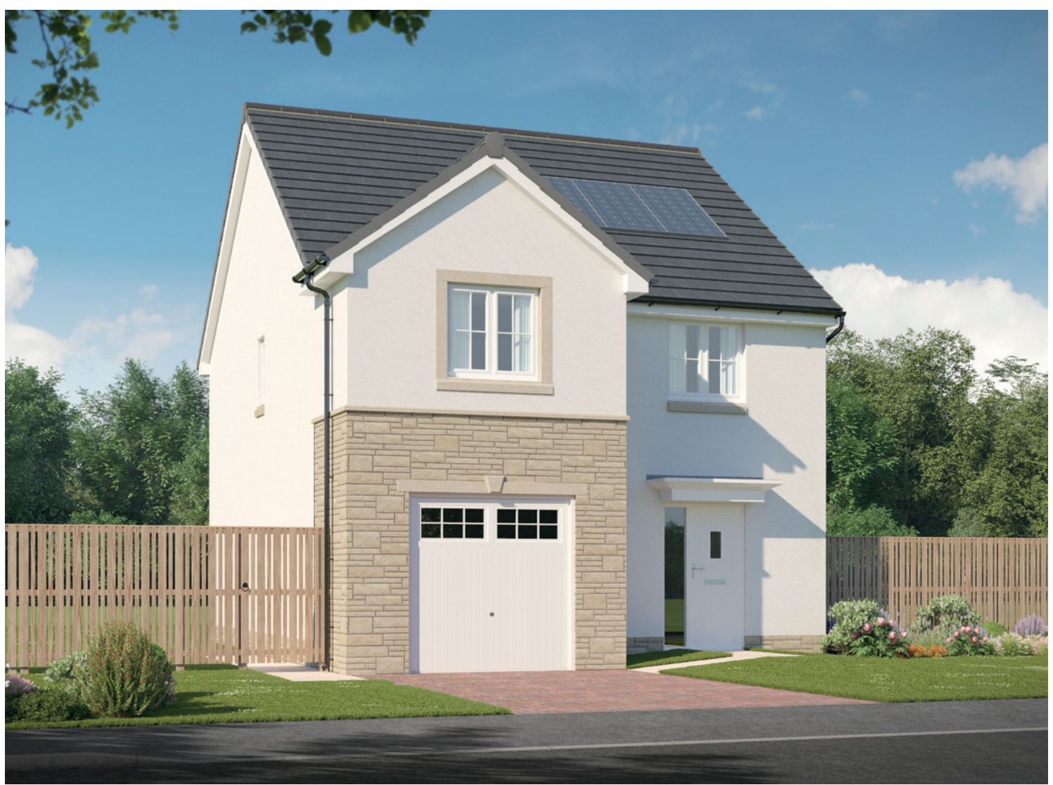
Please note Photo Voltaic (solar) panels shown above are indicative only. The location and number of panels are dependent on plot orientation. Please see Sales Advisor for details.

FOUR BEDROOM DETACHED HOME WITH INTEGRAL GARAGE