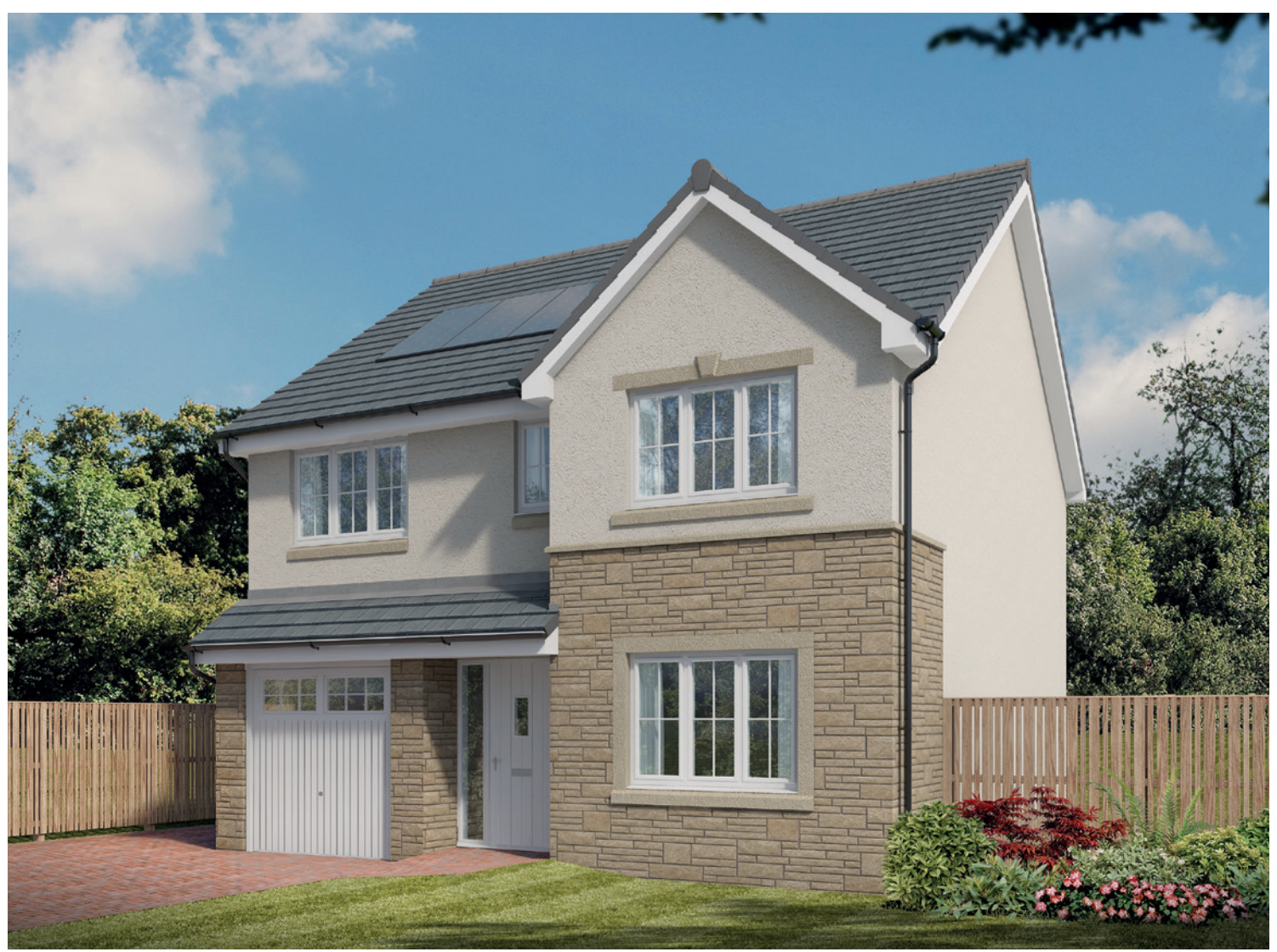
Please note Photo Voltaic (solar) panels shown above are indicative only. The location and number of panels are dependent on plot orientation. Please see Sales Advisor for details.

FOUR BEDROOM DETACHED HOME WITH INTEGRAL GARAGE