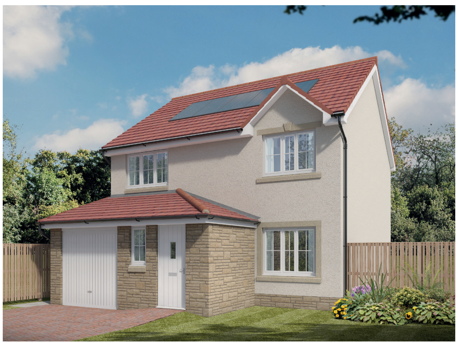
Please note Photo Voltaic (solar) panels shown above are indicative only. The location and number of panels are dependent on plot orientation. Please see Sales Advisor for details.

THREE BEDROOM DETACHED HOME WITH INTEGRAL GARAGE