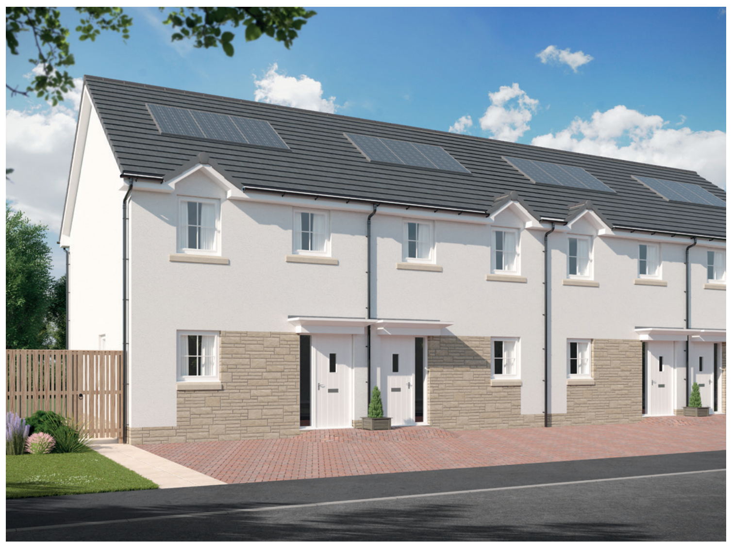
Please note Photo Voltaic (solar) panels shown above are indicative only. The location and number of panels are dependent on plot orientation. Please see Sales Advisor for details.