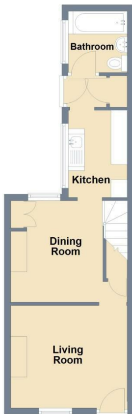
Ground Floor Approx. 33.8 sq. metres (364.3 sq. feet)