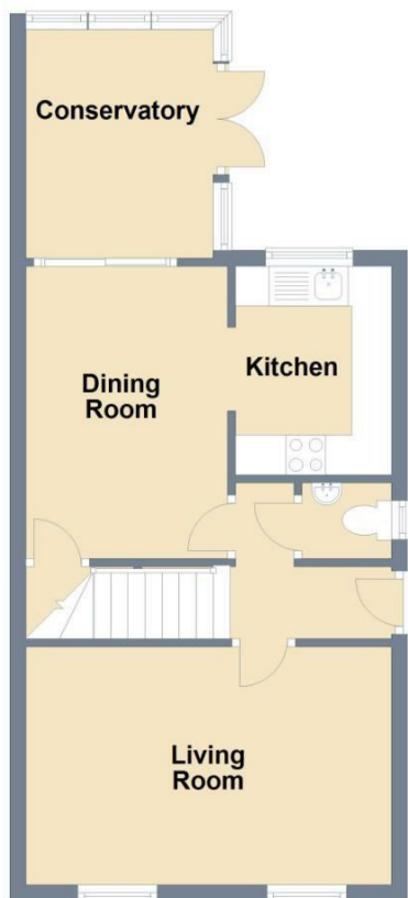
Ground Floor Approx. 43.0 sq. metres (462.8 sq. feet)