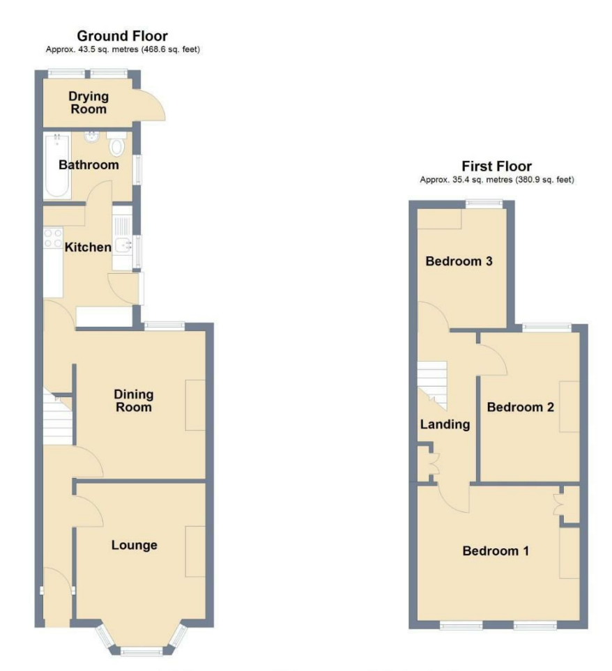
Total area: approx. 78.9 sq. metres (849.4 sq. feet)