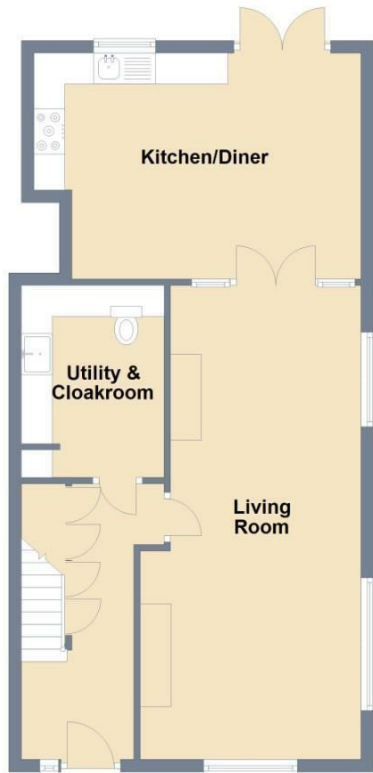
Ground Floor Approx. 61.0 sq. metres (656.7 sq. feet)