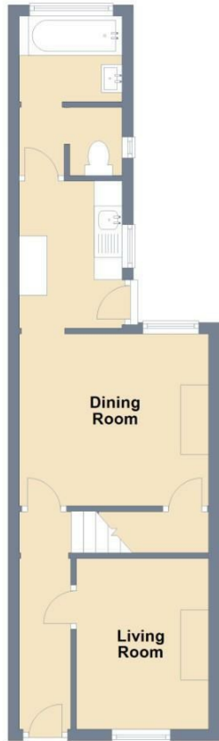
Ground Floor Approx. 34.6 sq. metres (372.0 sq. feet)