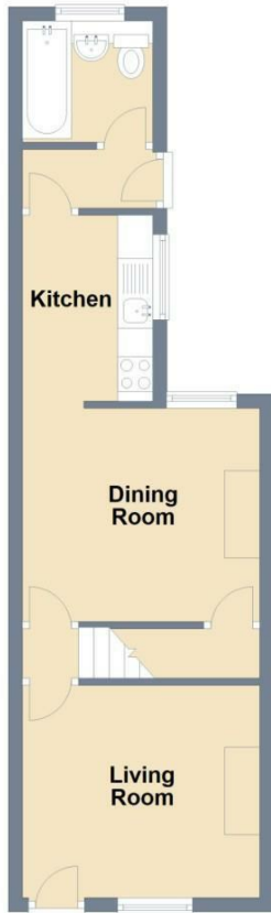
Ground Floor Approx. 34.0 sq. metres (366.0 sq. feet)