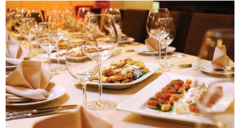
Food at the Hafod Hotel