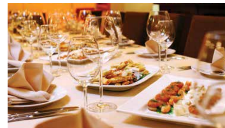
Food at the Hafod Hotel