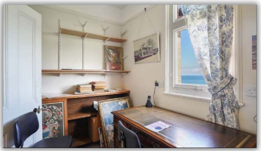
Bedroom 4/Study Sea Views