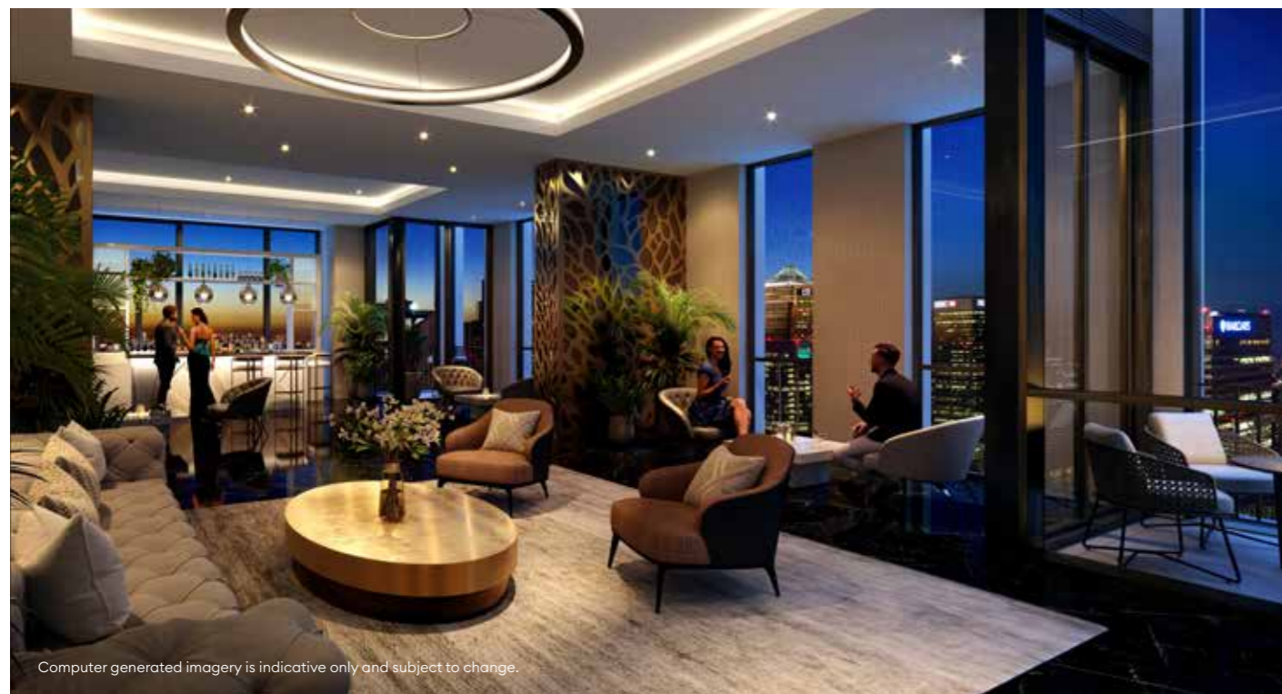
Computer generated imagery is indicative only and subject to change.