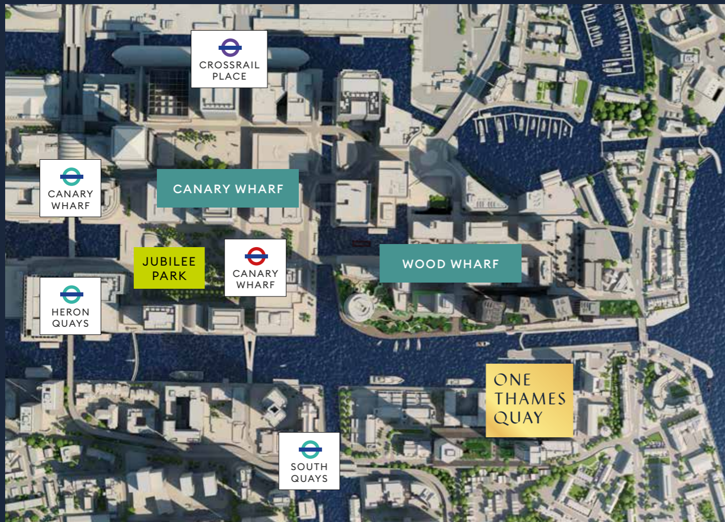
Computer generated image is indicative only and subject to change.