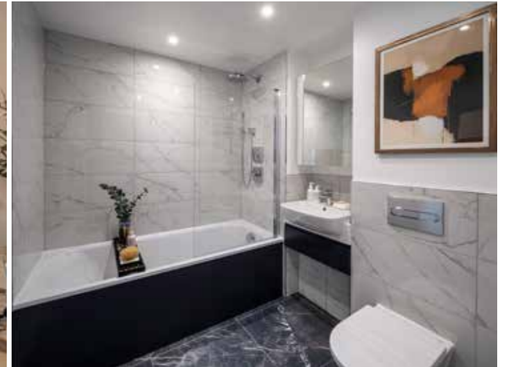
Actual photography of the One Thames Quay Show Apartment