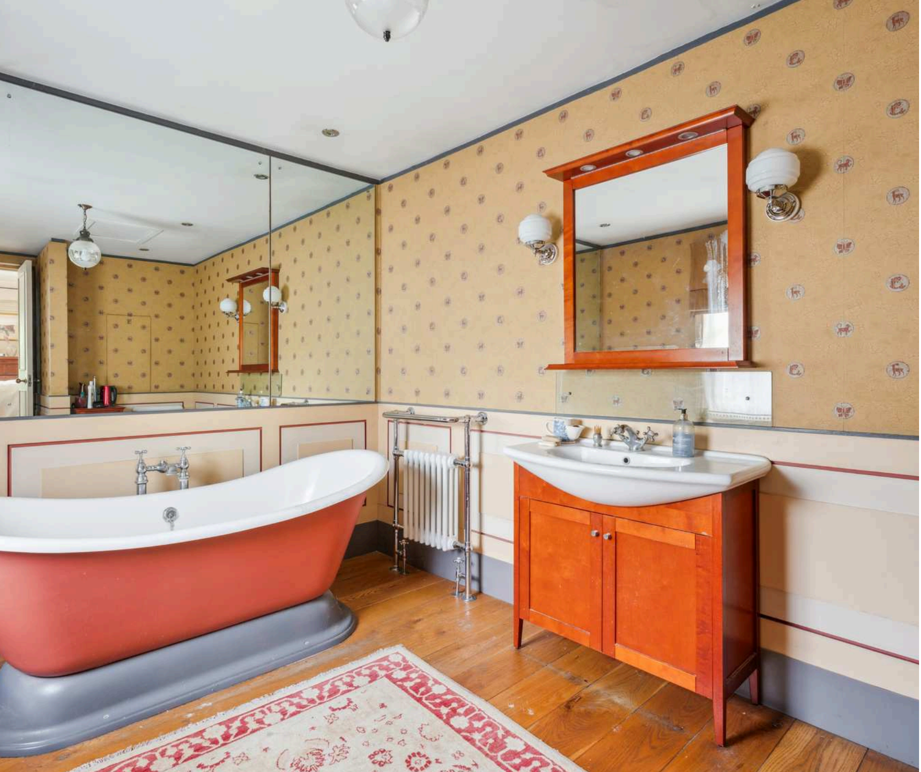
VICTORIA COTTAGE, WINKFIELD ROW