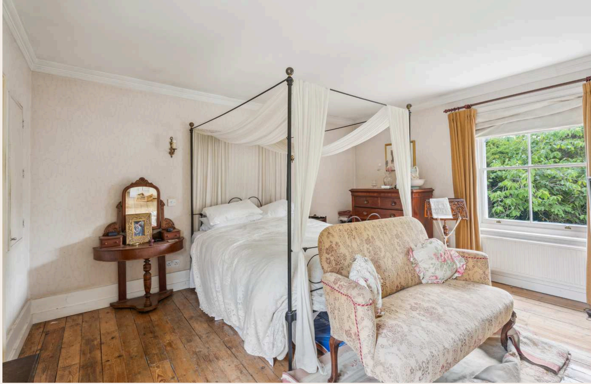
VICTORIA COTTAGE, WINKFIELD ROW