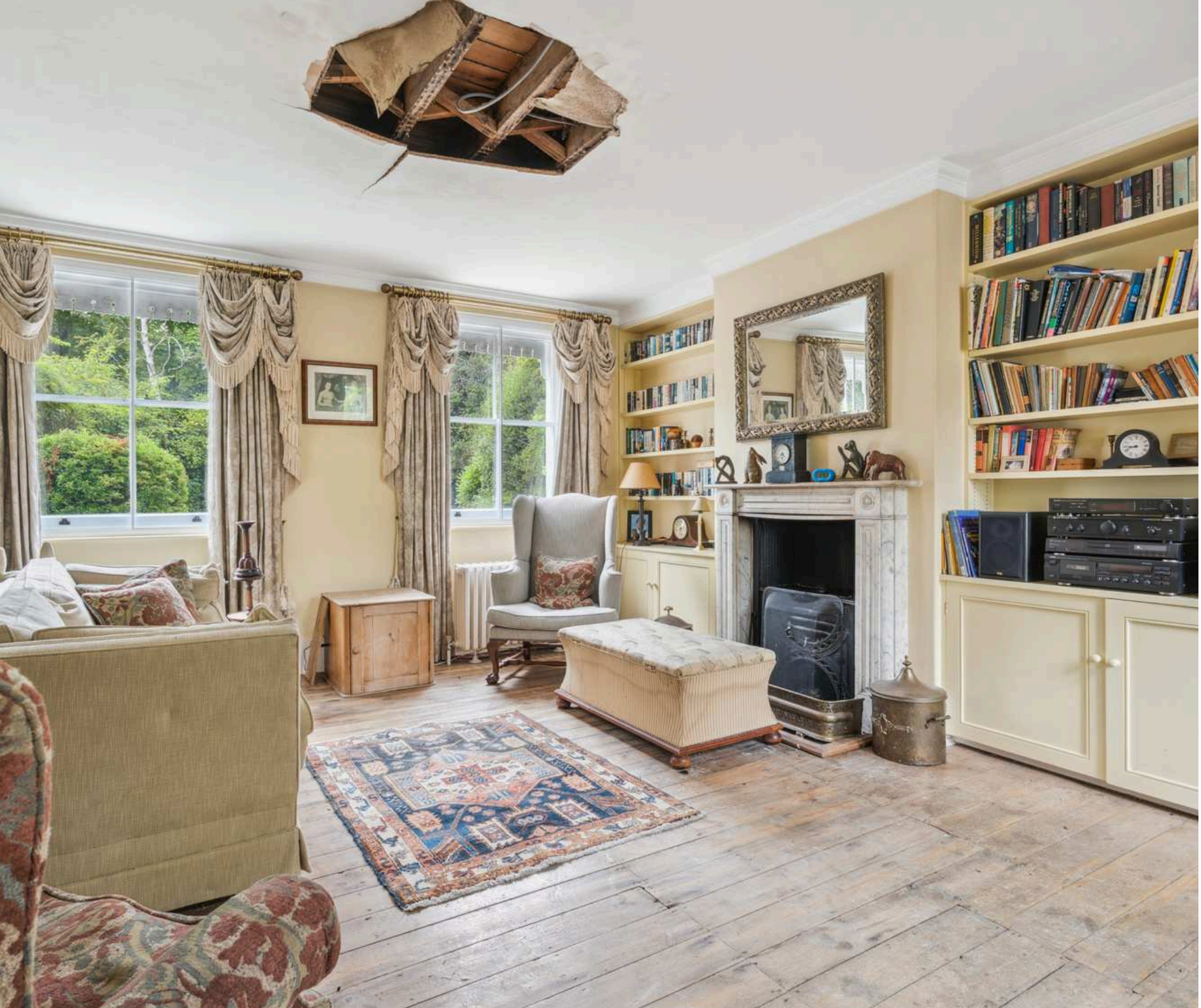
VICTORIA COTTAGE, WINKFIELD ROW