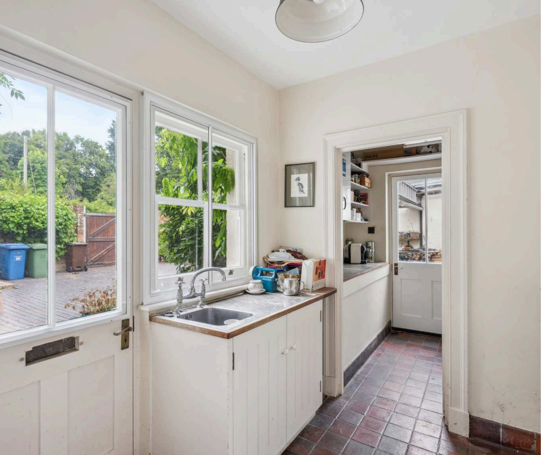
VICTORIA COTTAGE, WINKFIELD ROW