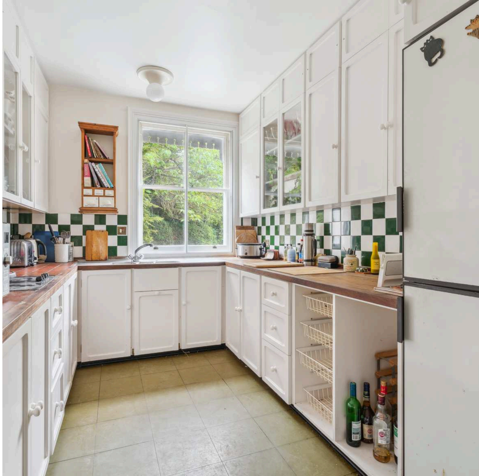
VICTORIA COTTAGE, WINKFIELD ROW