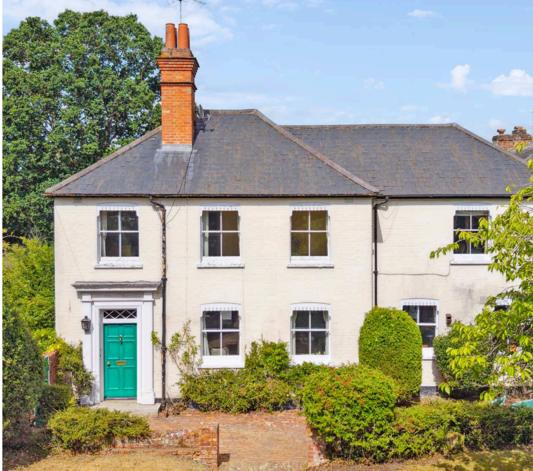
VICTORIA COTTAGE, WINKFIELD ROW