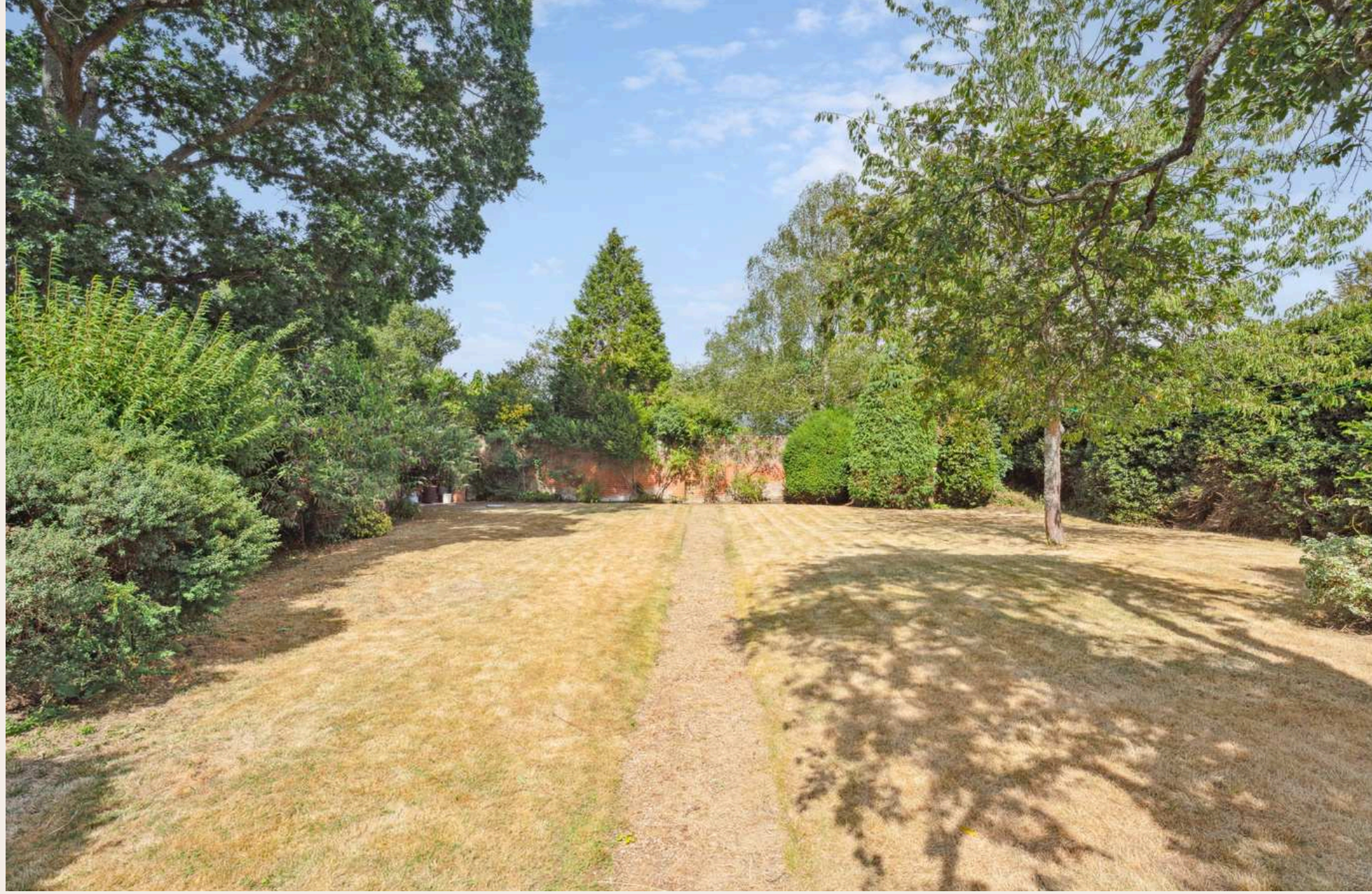
VICTORIA COTTAGE, WINKFIELD ROW