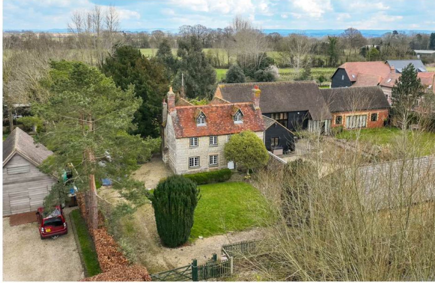
STUART HOUSE, MARSH BALDON, OXFORDSHIRE