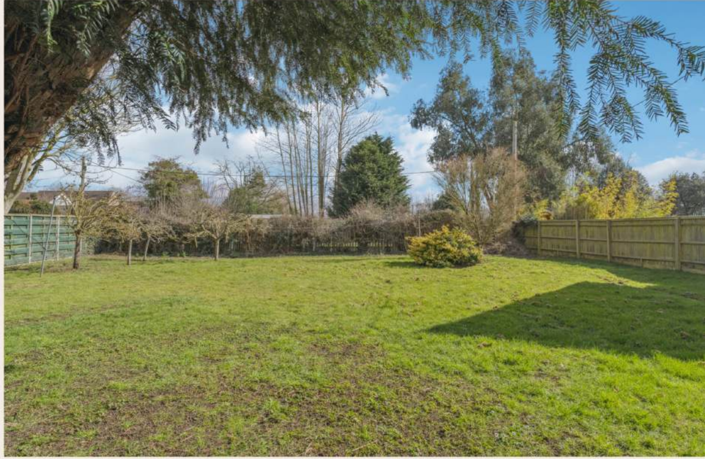
STUART HOUSE, MARSH BALDON, OXFORDSHIRE