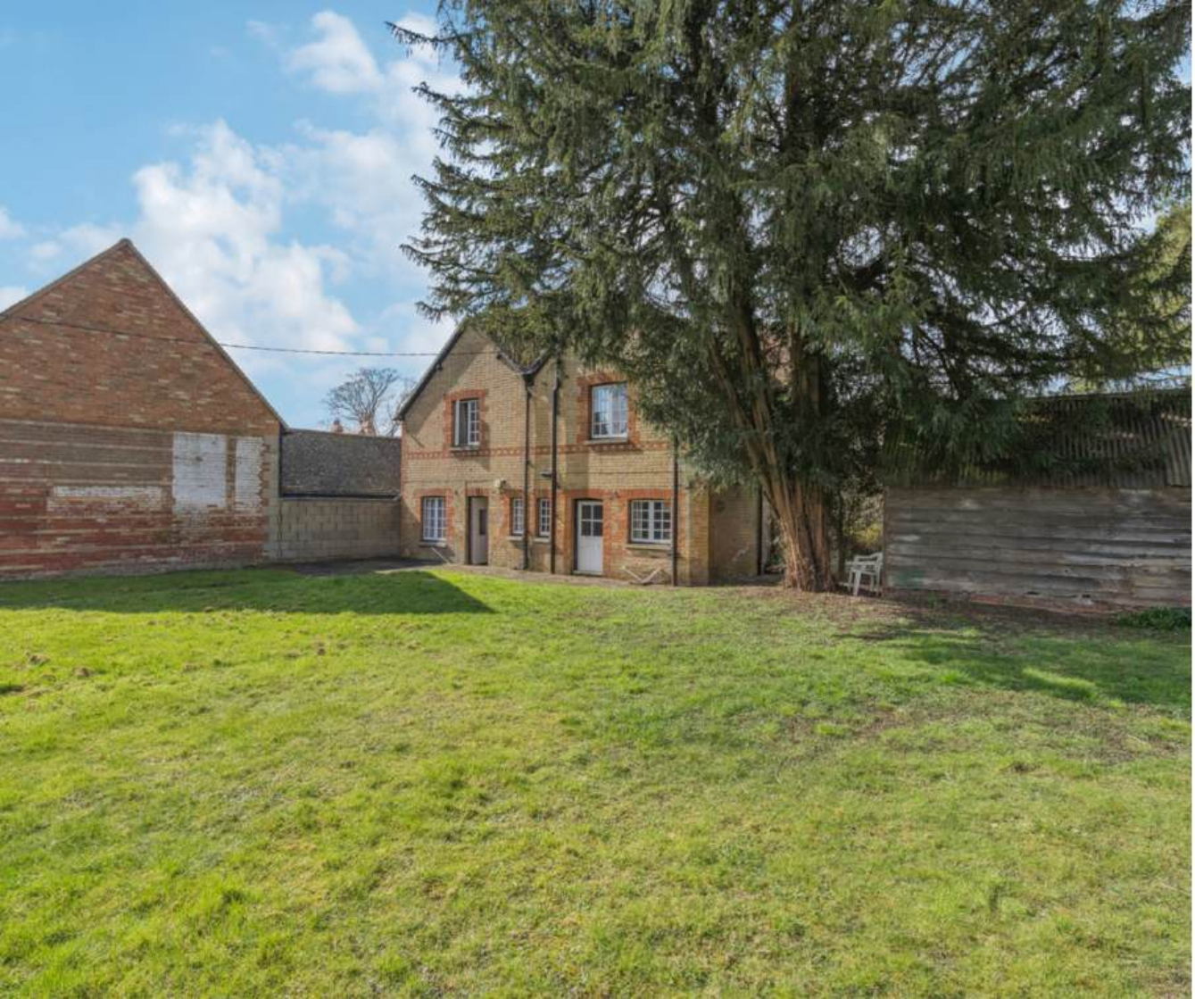
STUART HOUSE, MARSH BALDON, OXFORDSHIRE