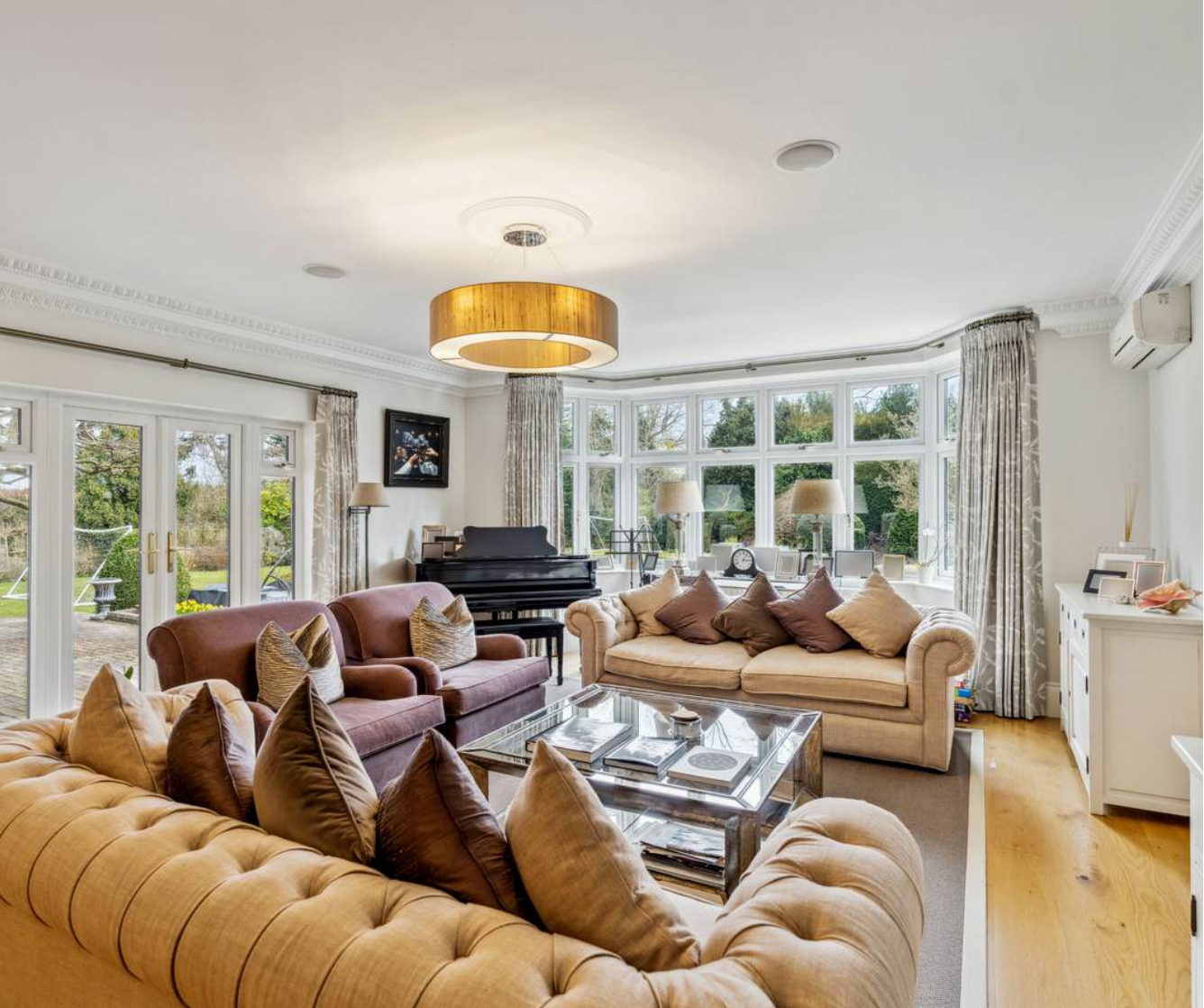
42 NORTH PARK, CHALFONT ST PETER