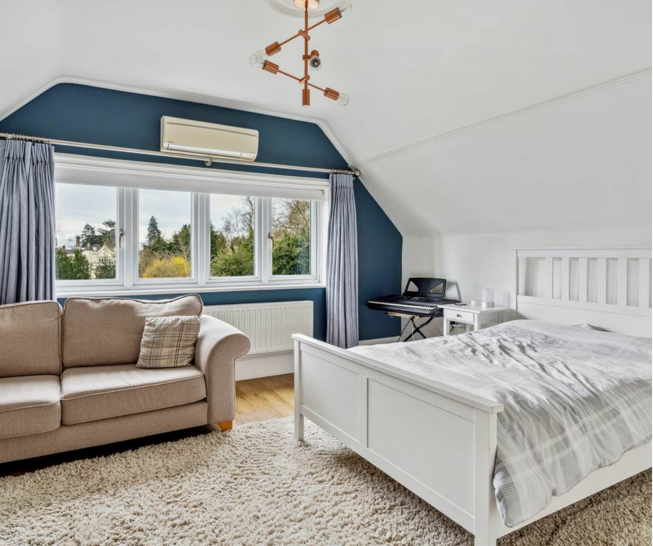
42 NORTH PARK, CHALFONT ST PETER