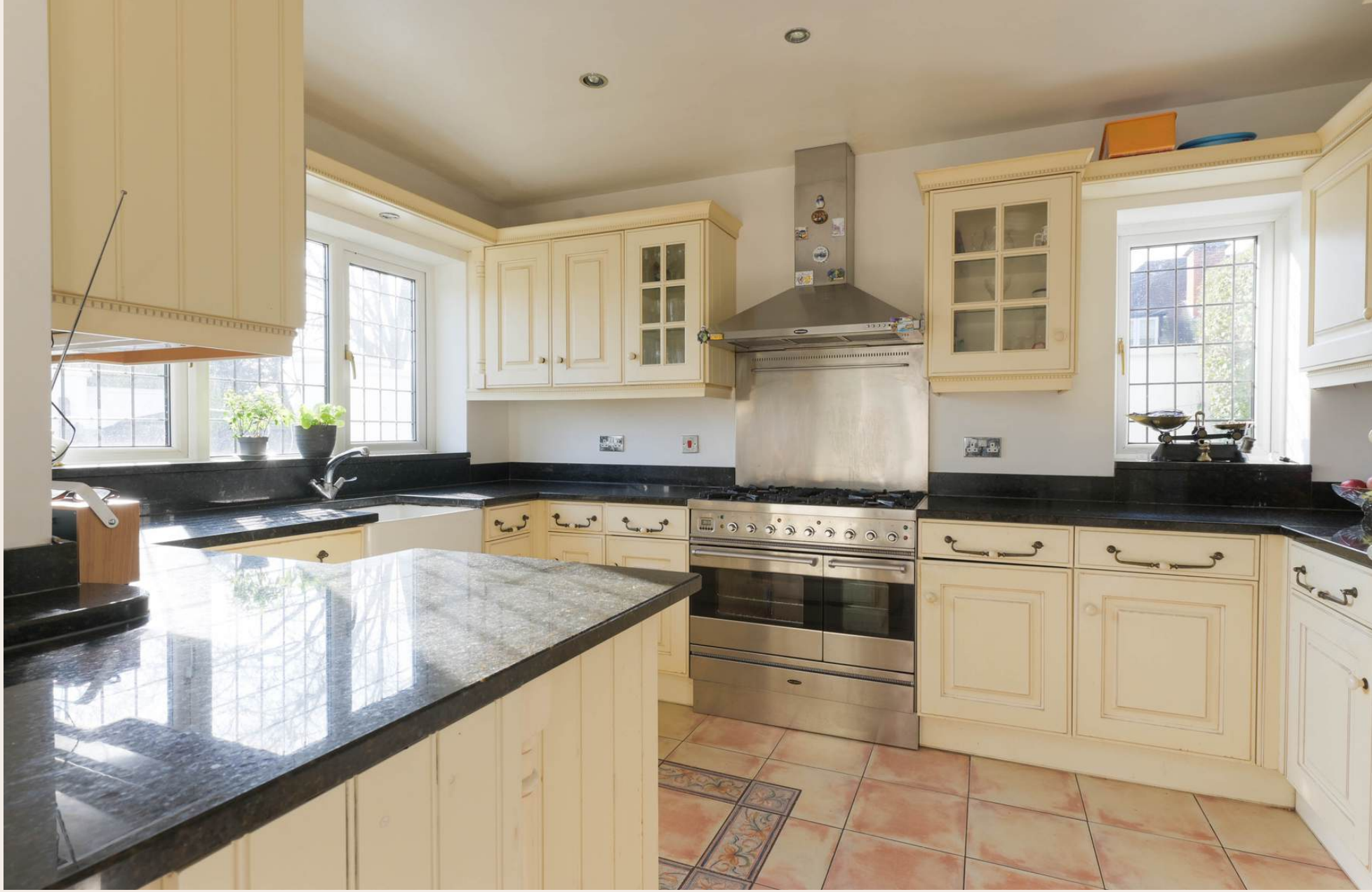
CARELESS CORNER, BRAY