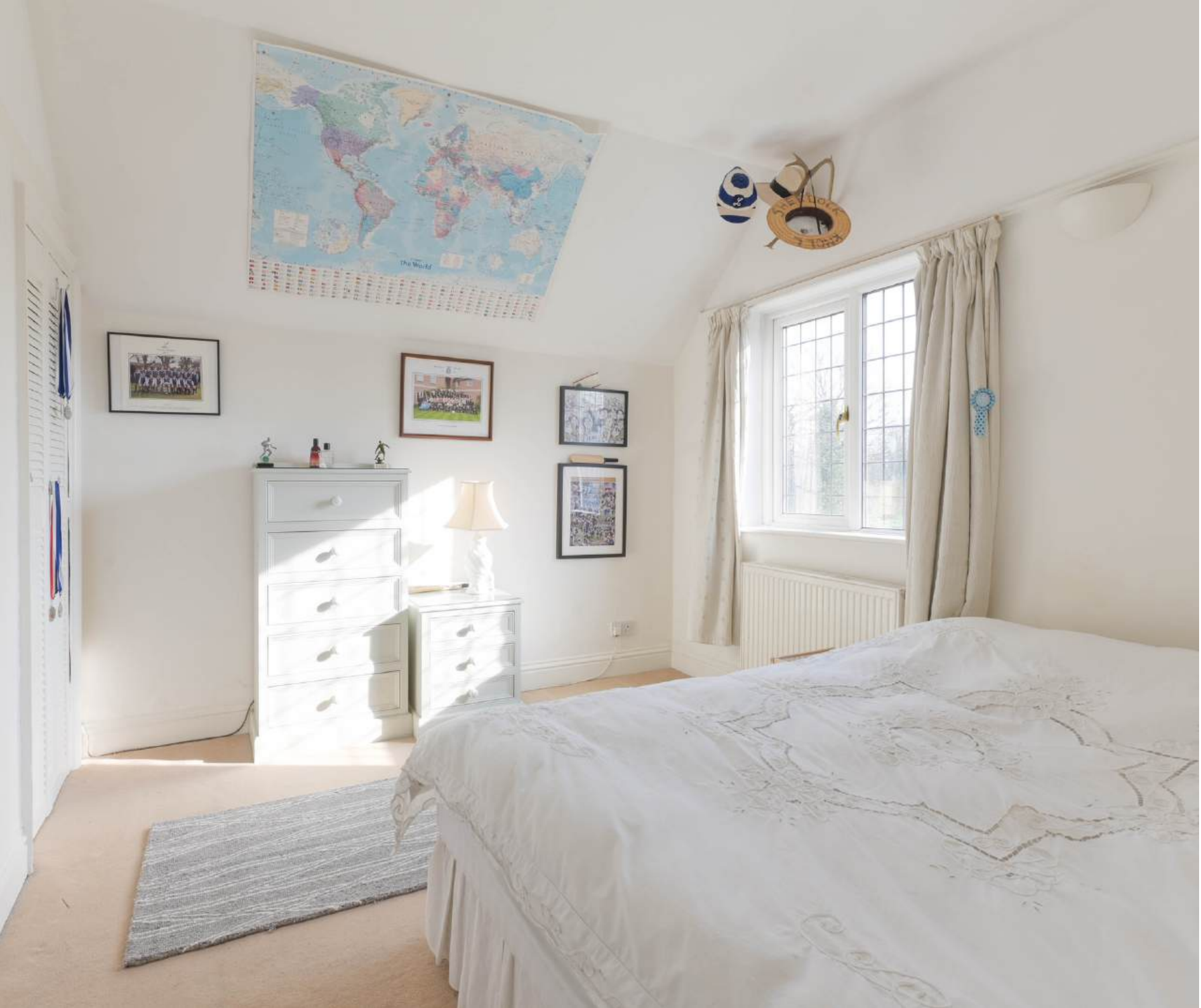
CARELESS CORNER, BRAY