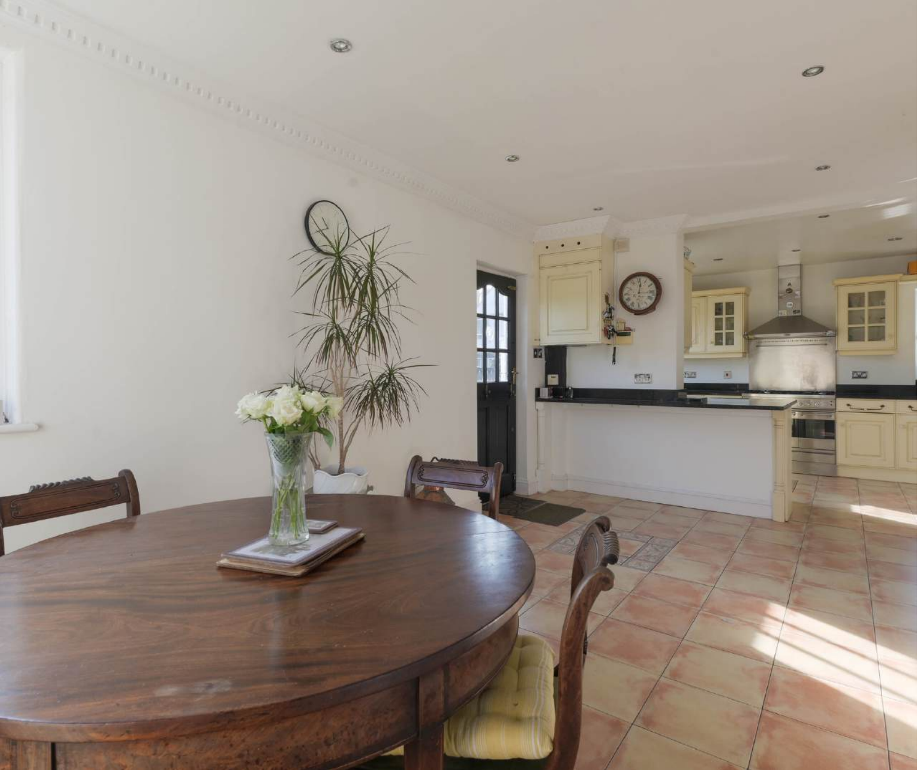
CARELESS CORNER, BRAY