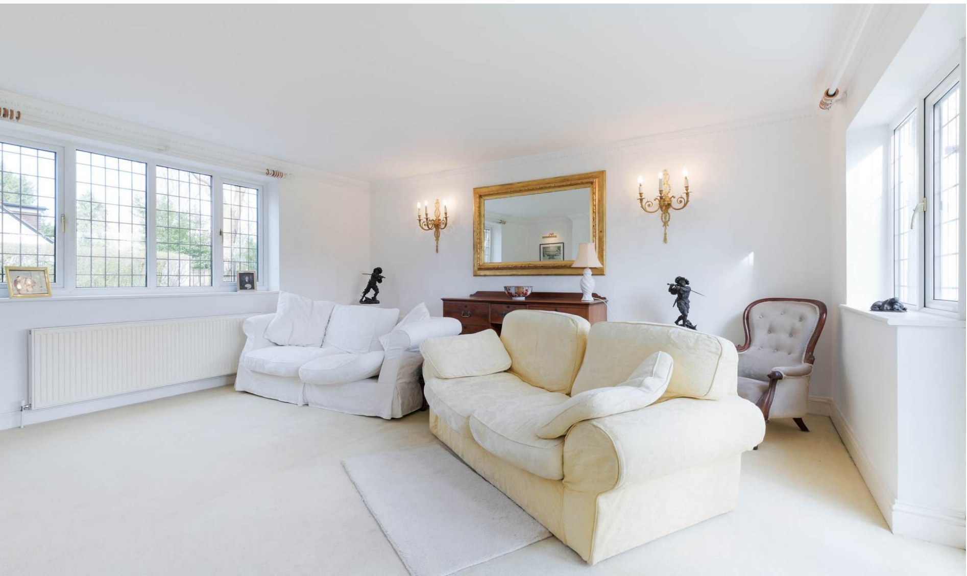
CARELESS CORNER, BRAY