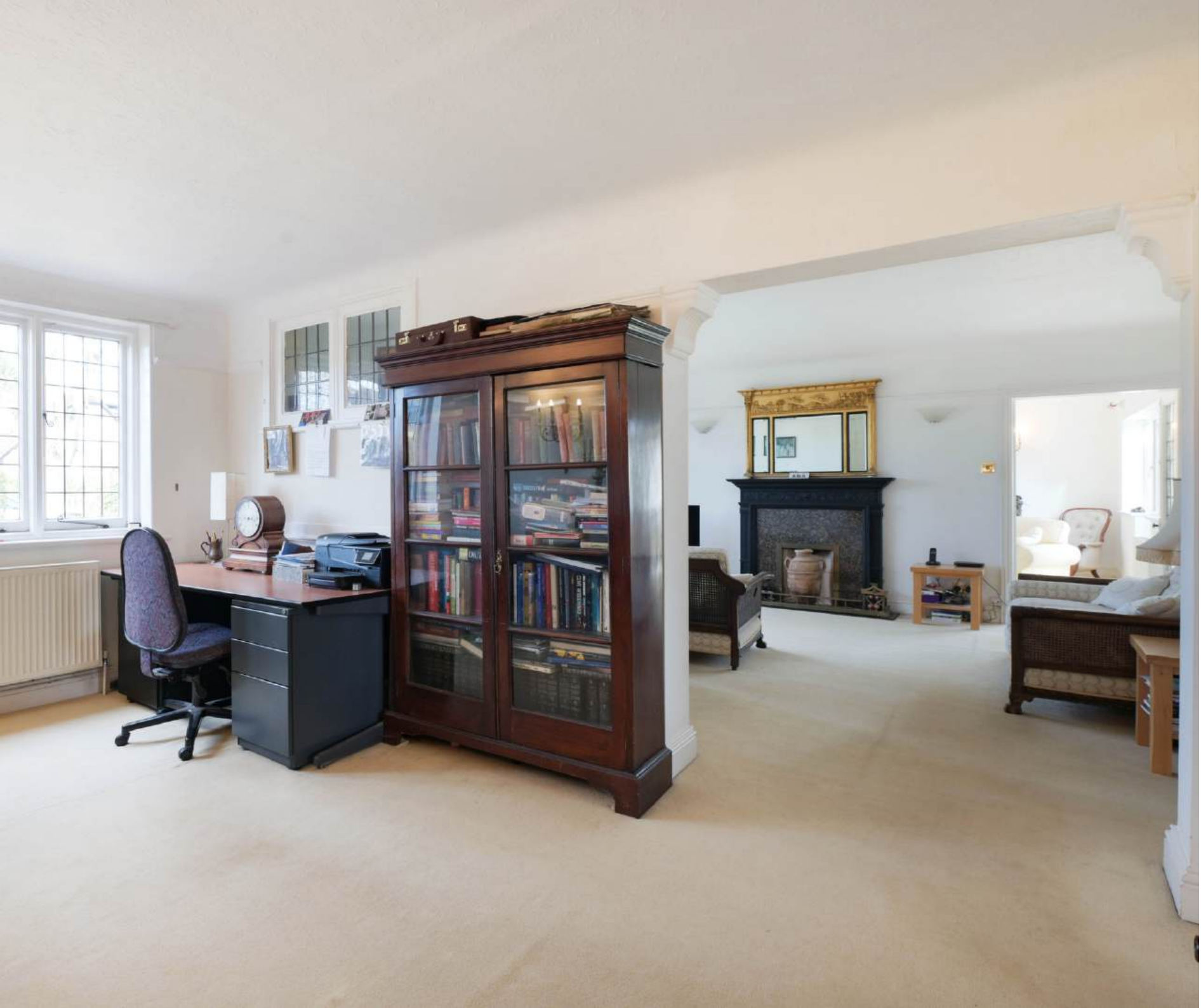
CARELESS CORNER, BRAY