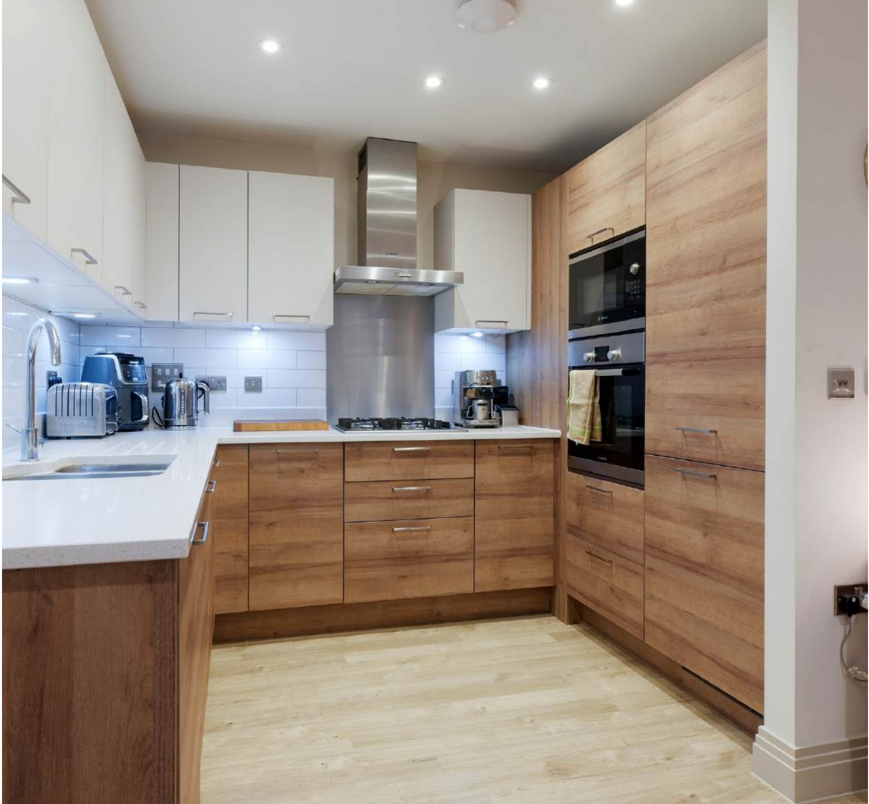
APARTMENT 4, BY THE GREEN COURT