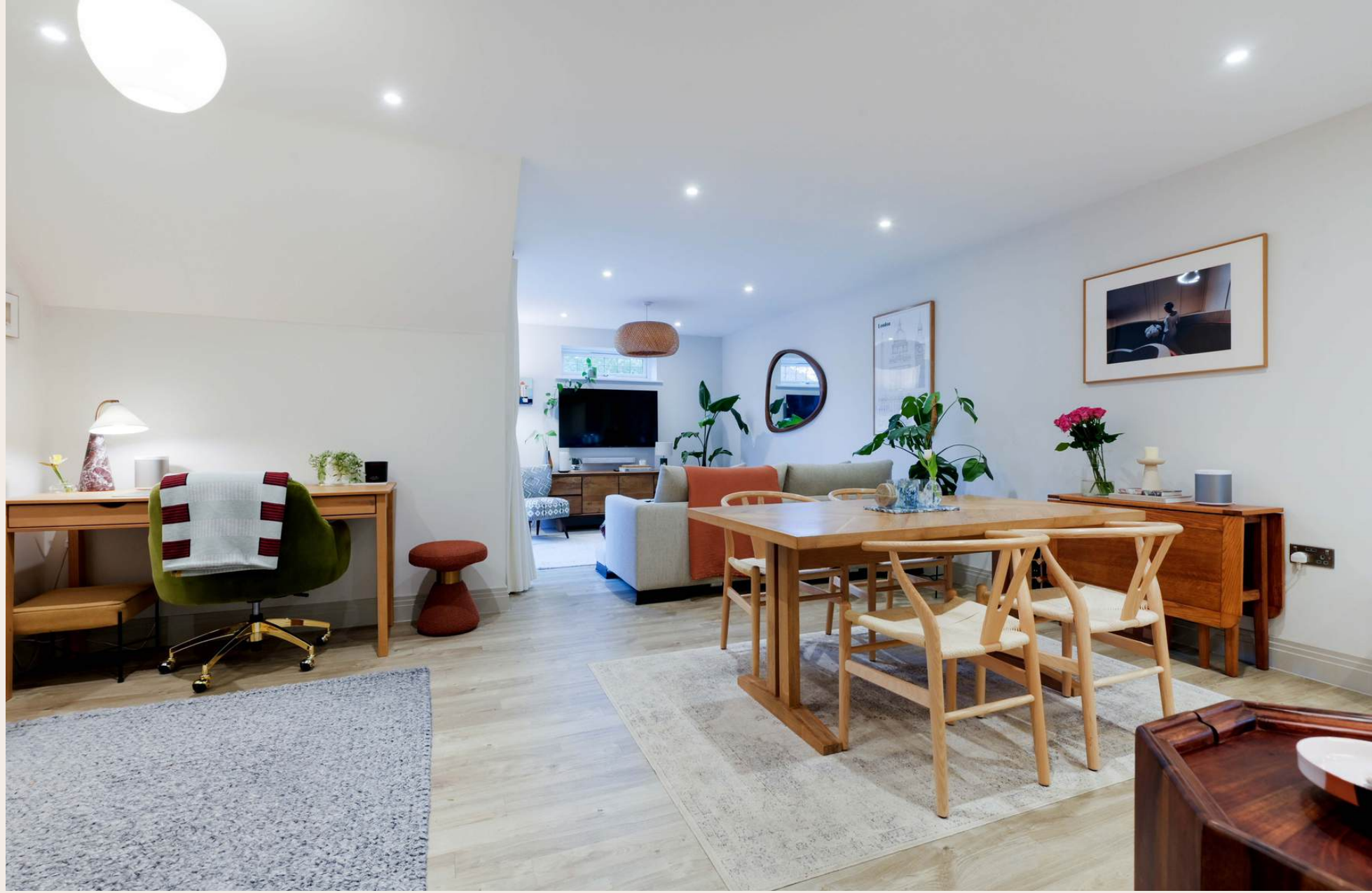
APARTMENT 4, BY THE GREEN COURT