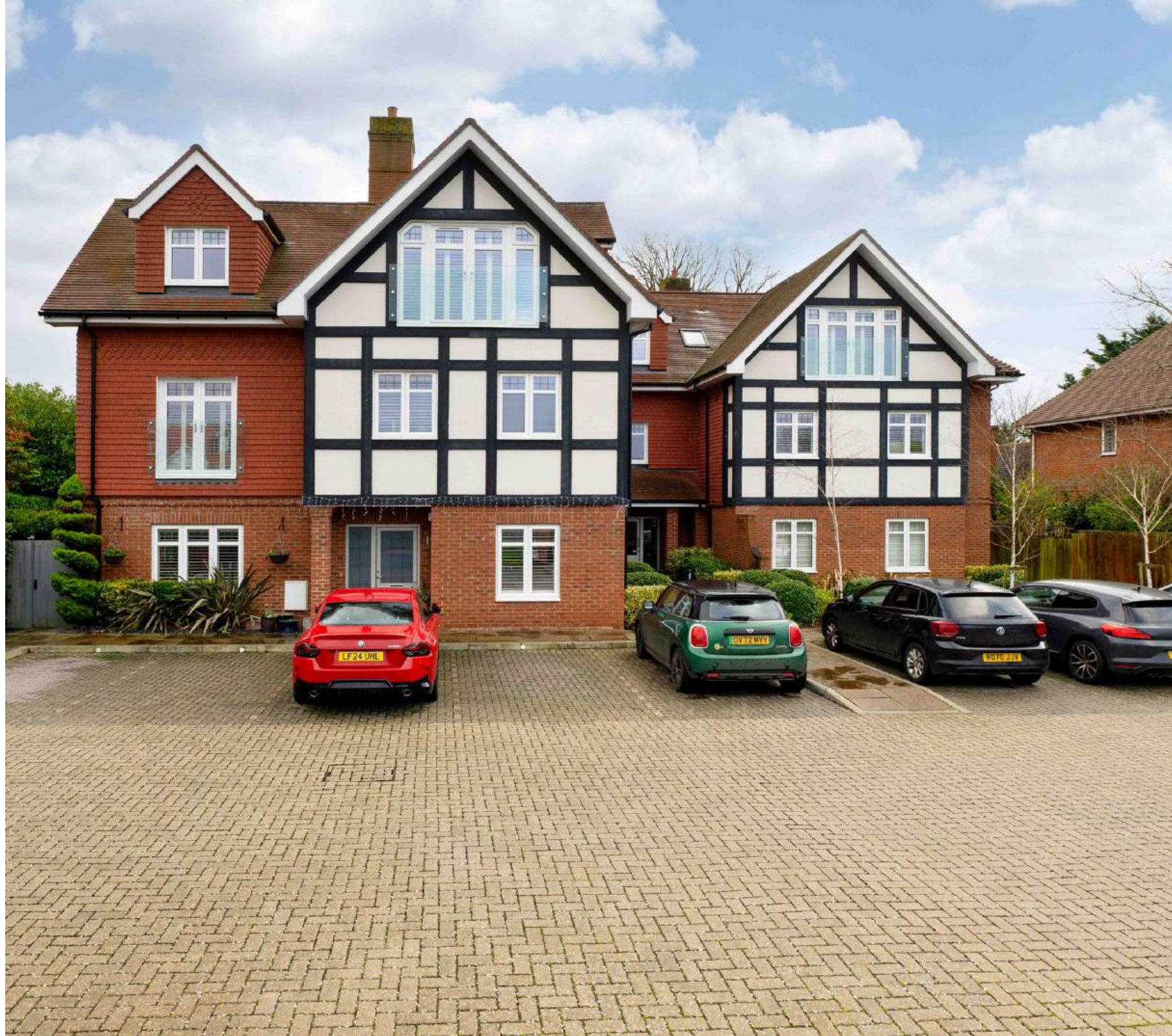
APARTMENT 4, BY THE GREEN COURT