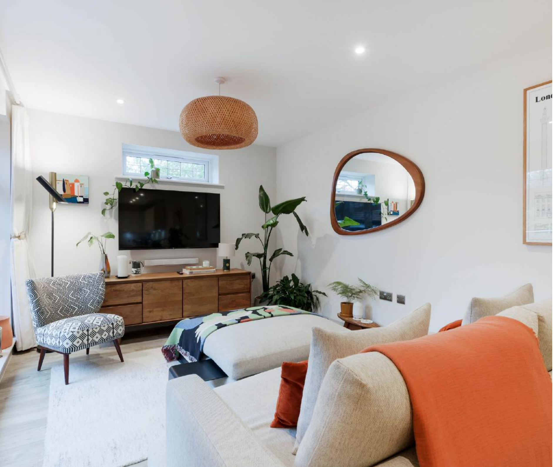
APARTMENT 4, BY THE GREEN COURT