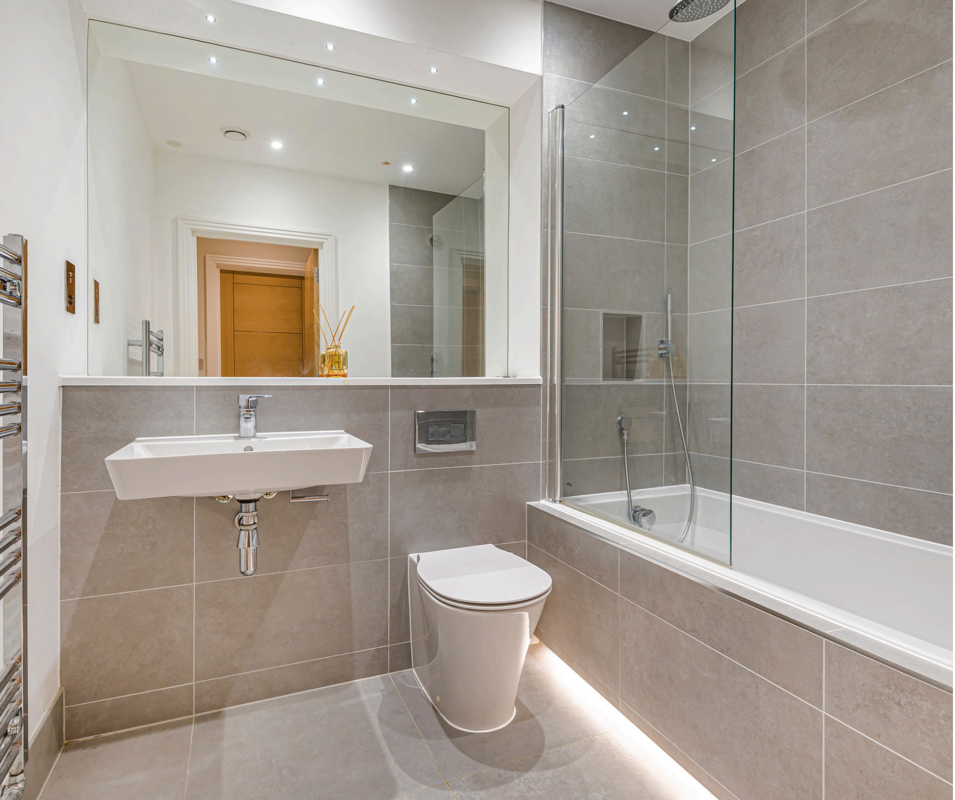
6 SANDALWOOD LODGE, WINDSOR