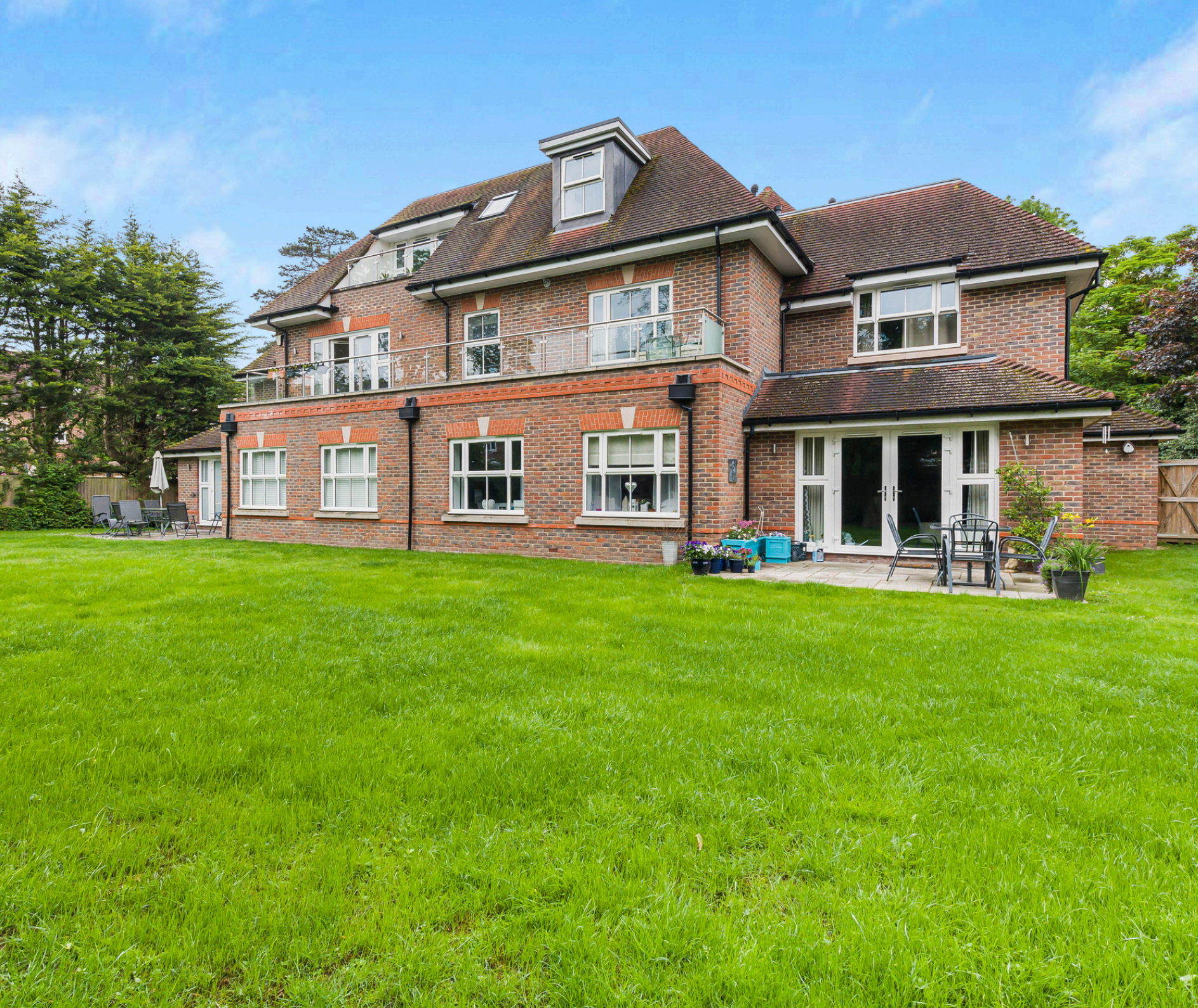
6 SANDALWOOD LODGE, WINDSOR