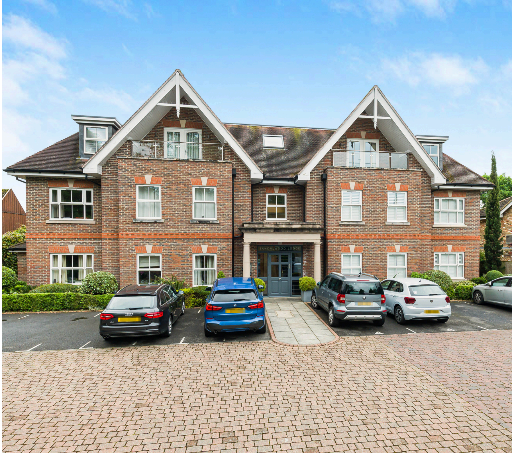
6 SANDALWOOD LODGE, WINDSOR