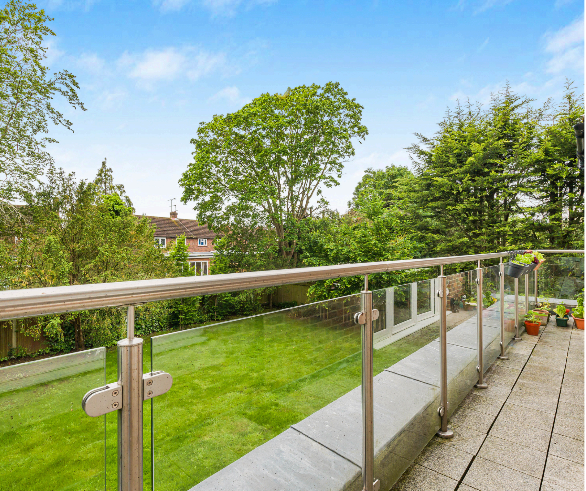
6 SANDALWOOD LODGE, WINDSOR