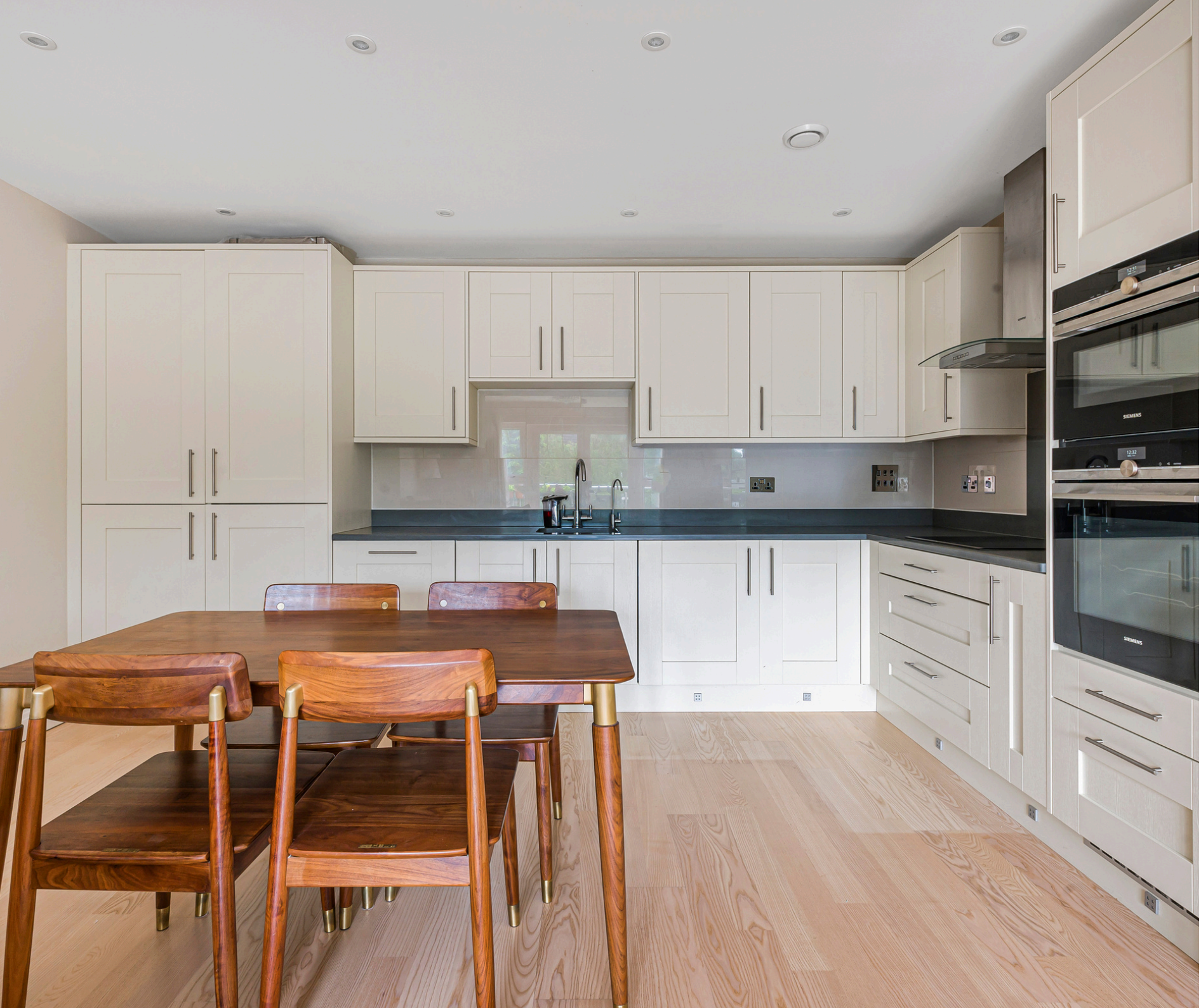
6 SANDALWOOD LODGE, WINDSOR