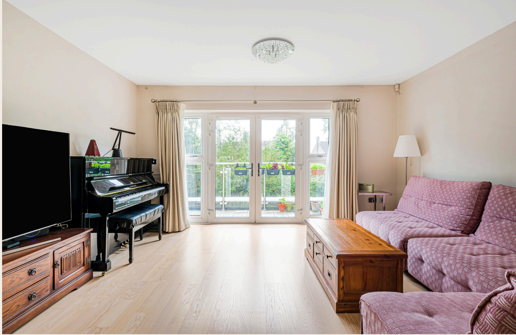
6 SANDALWOOD LODGE, WINDSOR