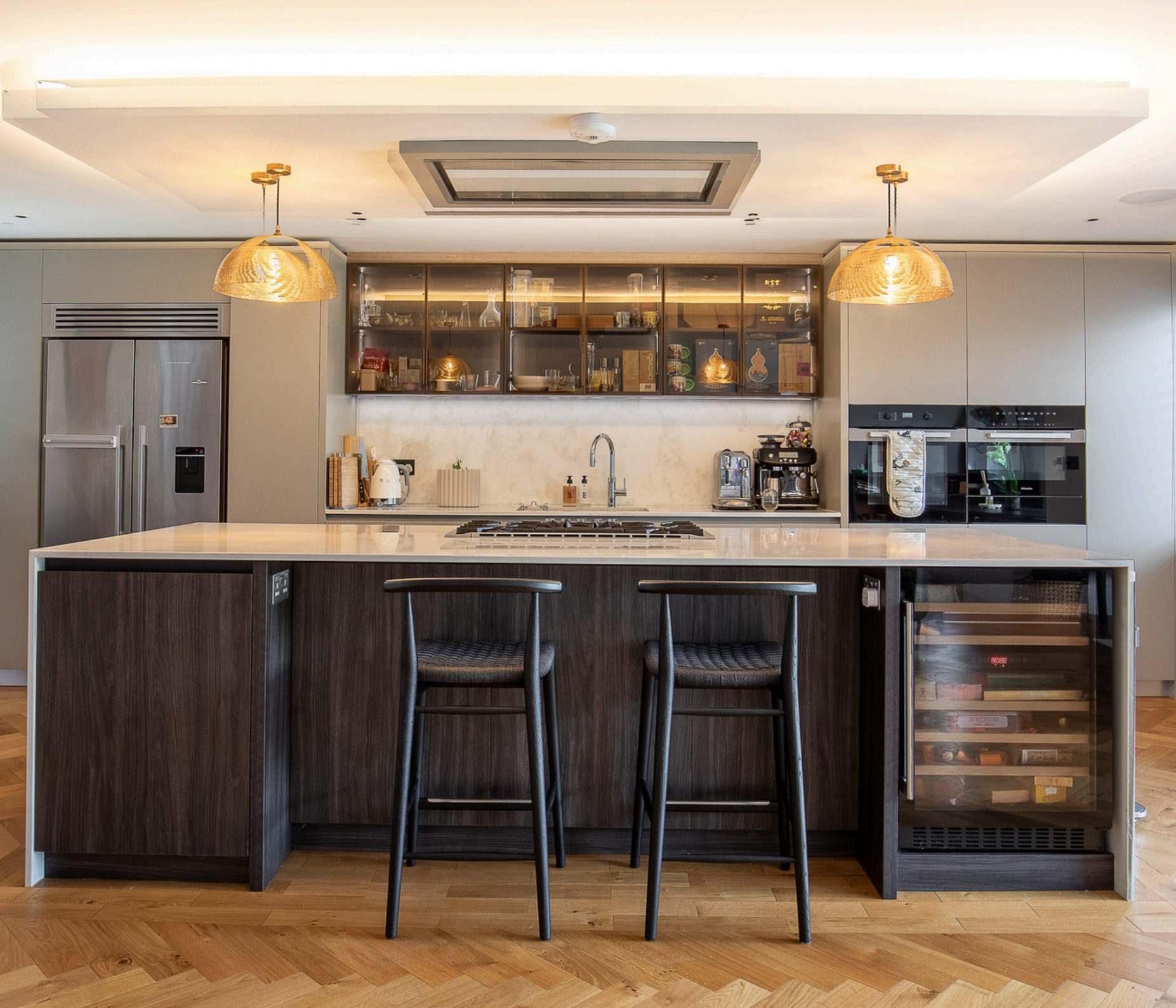
MULBERRY HOUSE, BRACKNELL