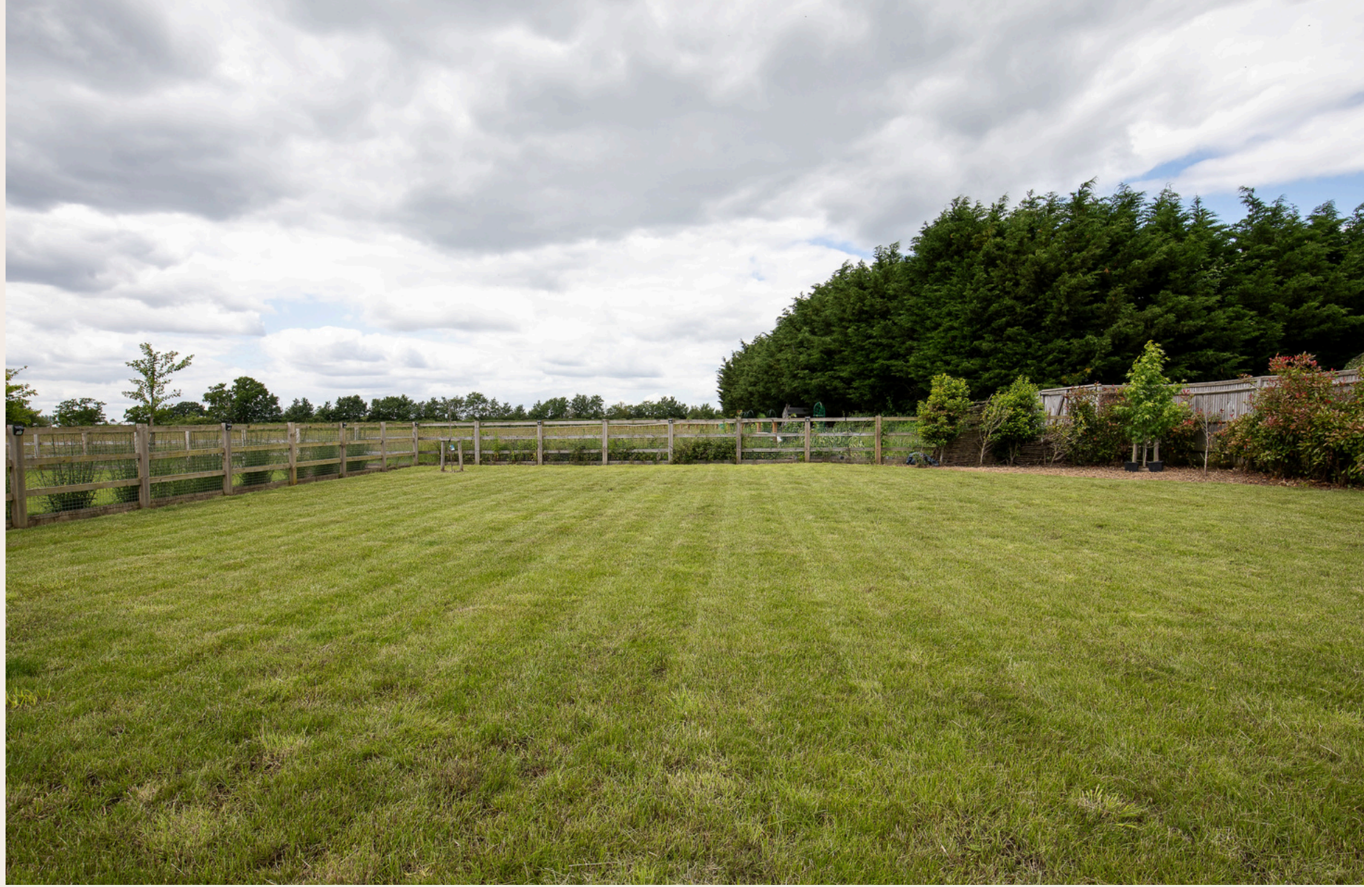
MULBERRY HOUSE, BRACKNELL