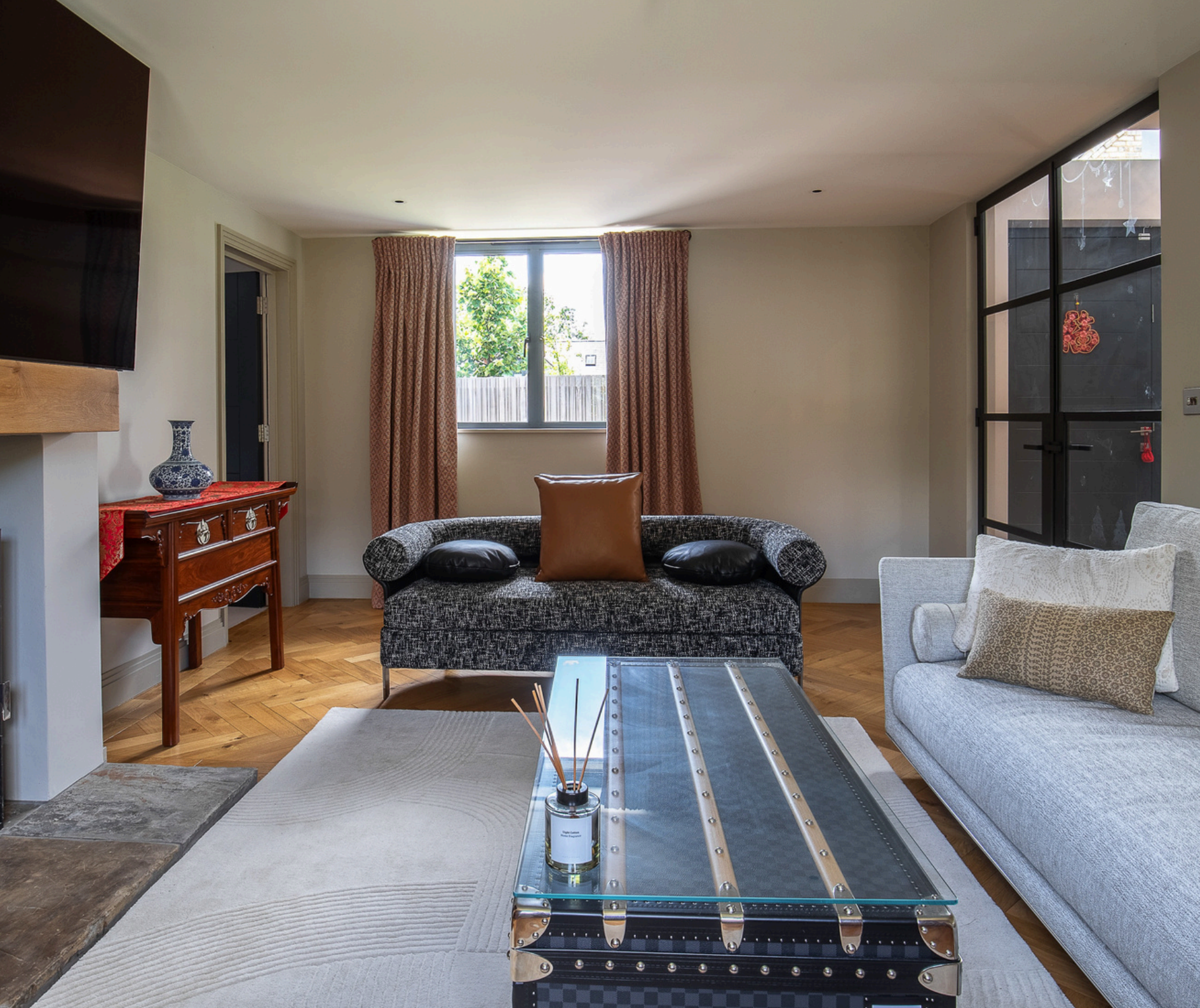
MULBERRY HOUSE, BRACKNELL