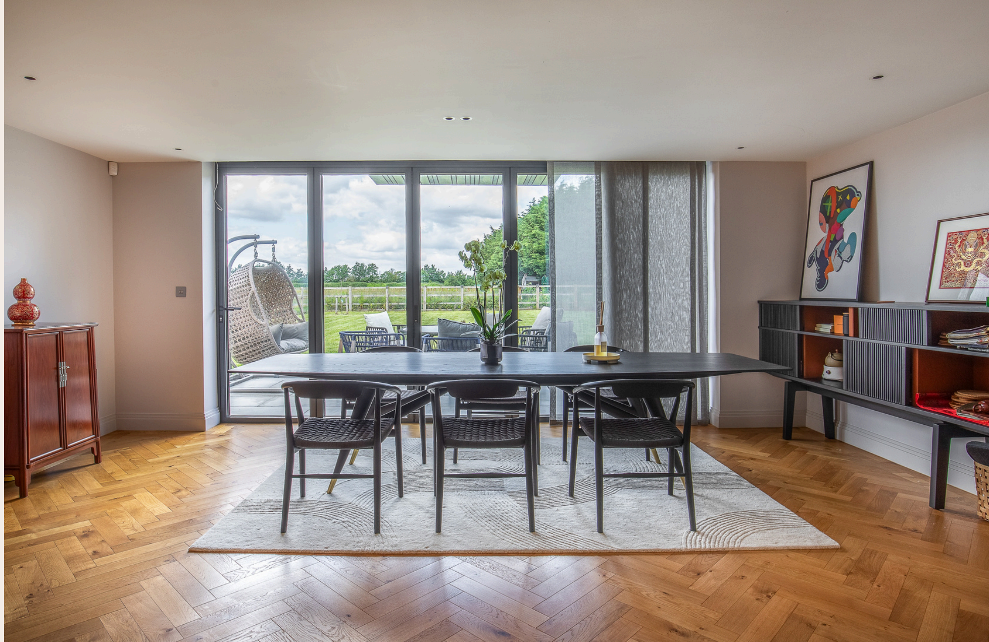
MULBERRY HOUSE, BRACKNELL