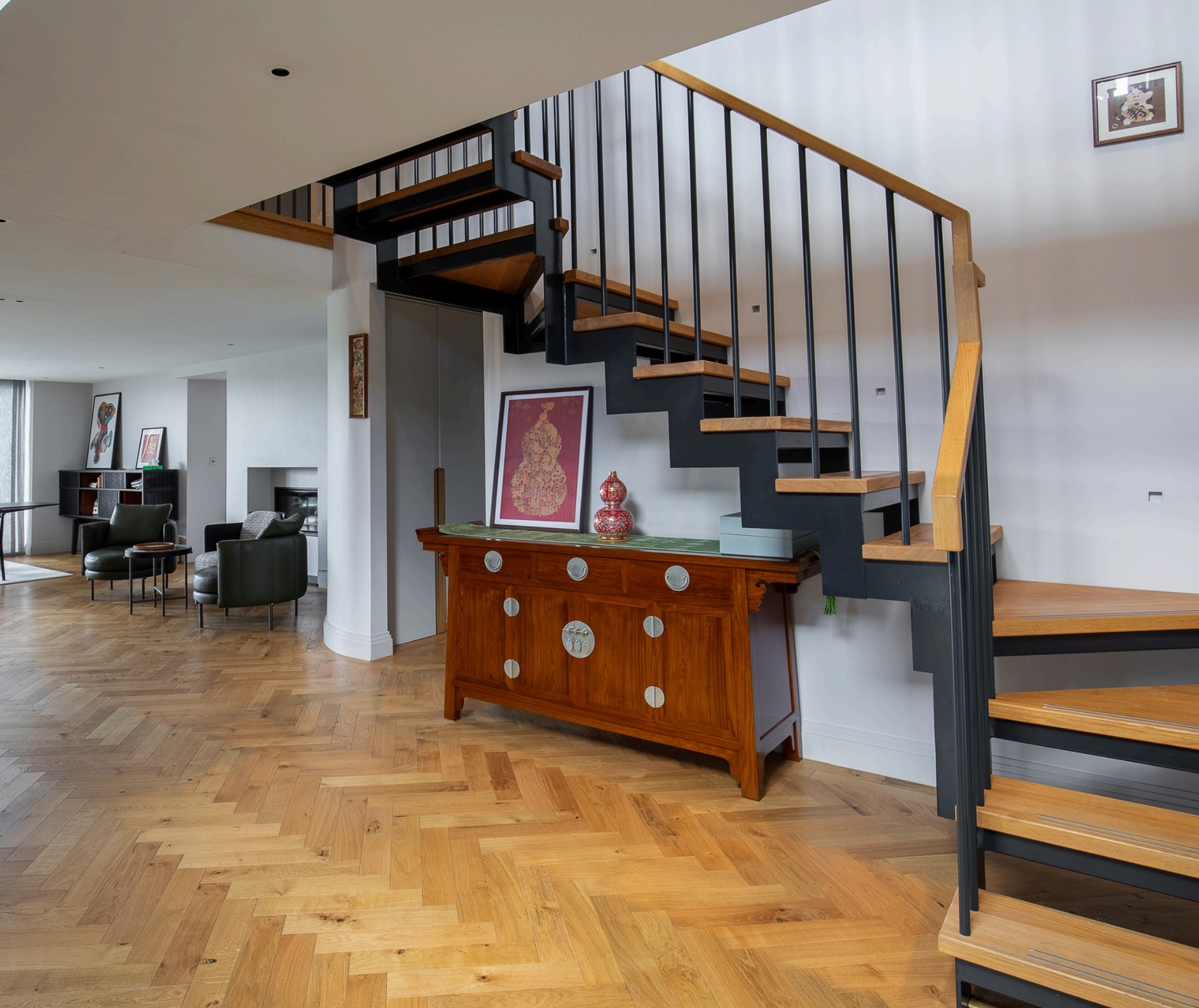
MULBERRY HOUSE, BRACKNELL