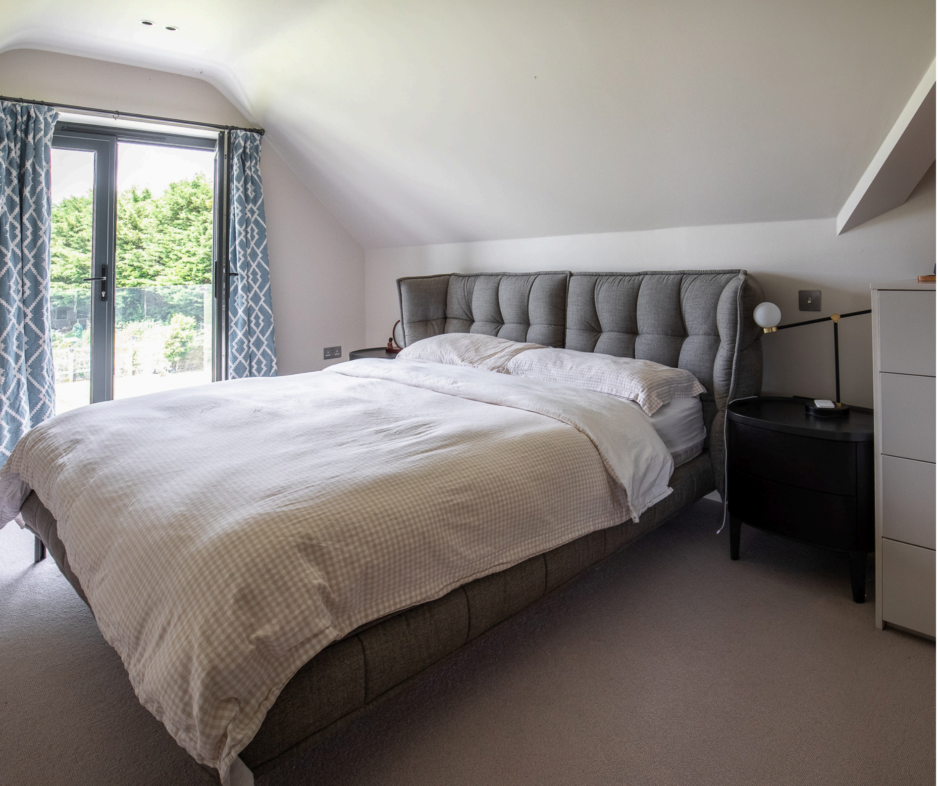
MULBERRY HOUSE, BRACKNELL