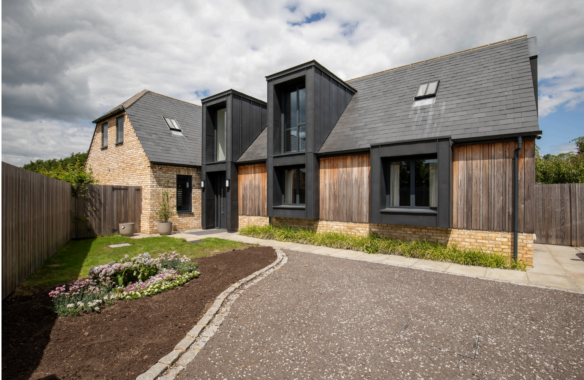
MULBERRY HOUSE, BRACKNELL