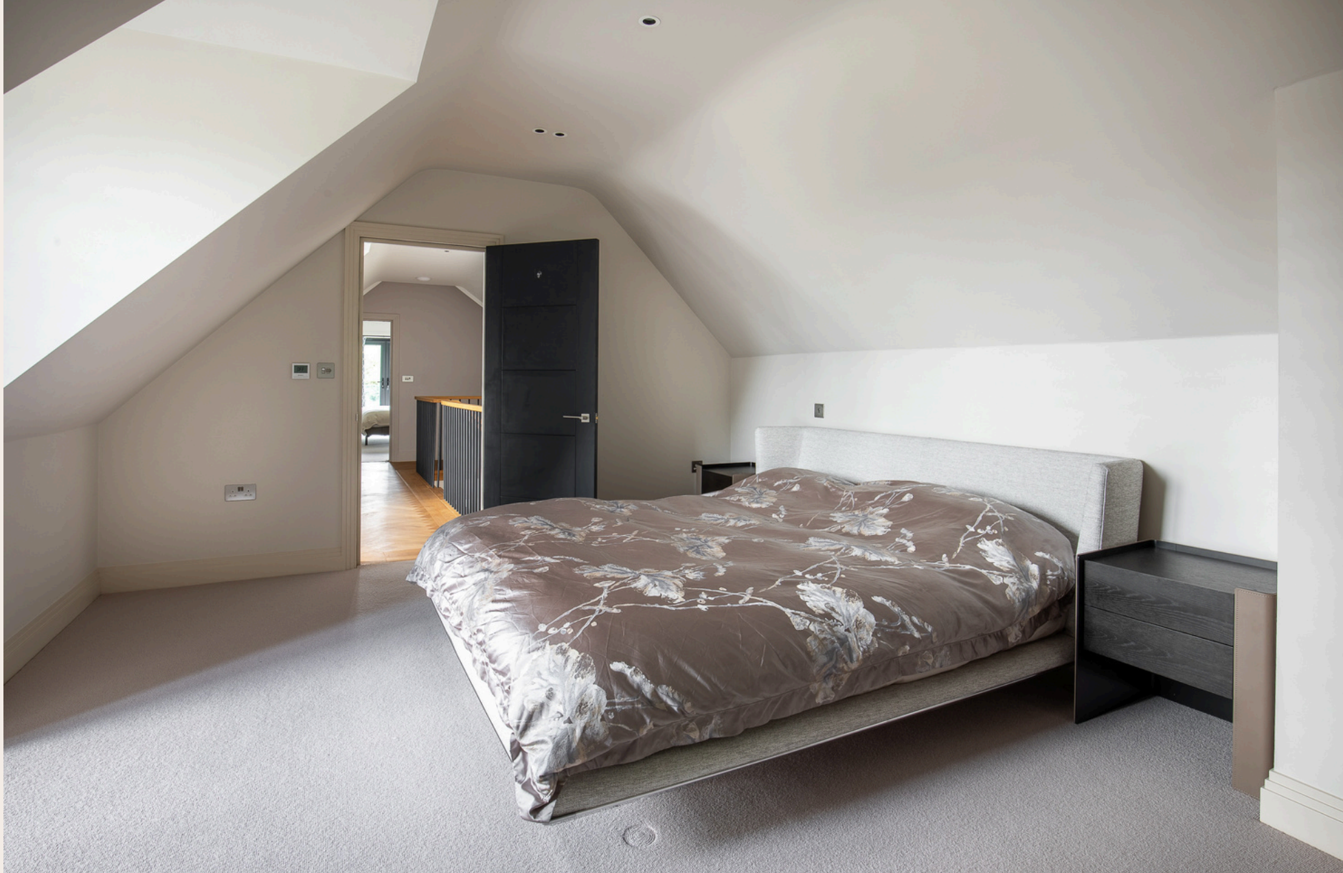
MULBERRY HOUSE, BRACKNELL