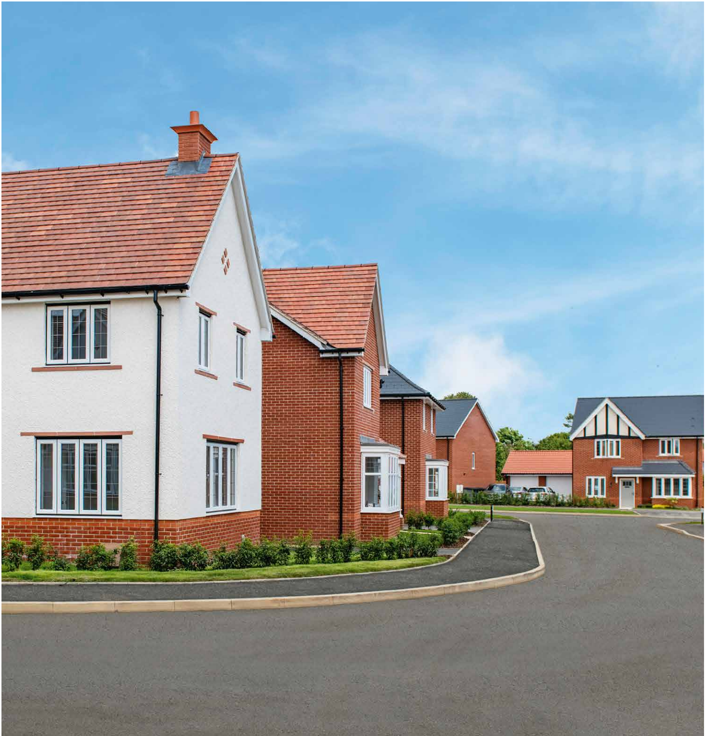
Image from Bloor Homes at Feering

THE YEAR WE STARTED MAKING DREAM HOMES A REALITY