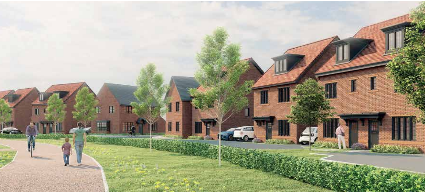
Bloor Homes at Felixstowe Street Scene

A great choice of amenities are also on your doorstep with Trimley Train Station just a short walk from home, characteristic cafes, well-stocked supermarkets, popular pubs and restaurants, leisure centres and hair and beauty salons.