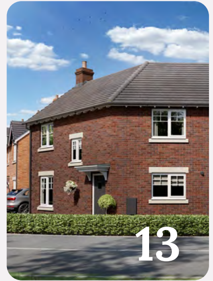
3 bedroom homes