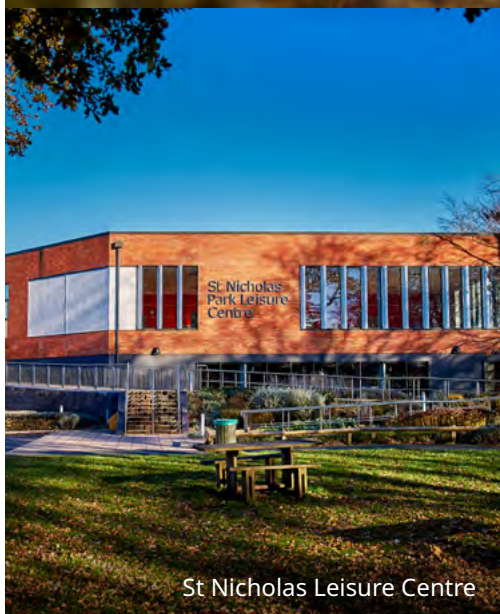
St Nicholas Leisure Centre