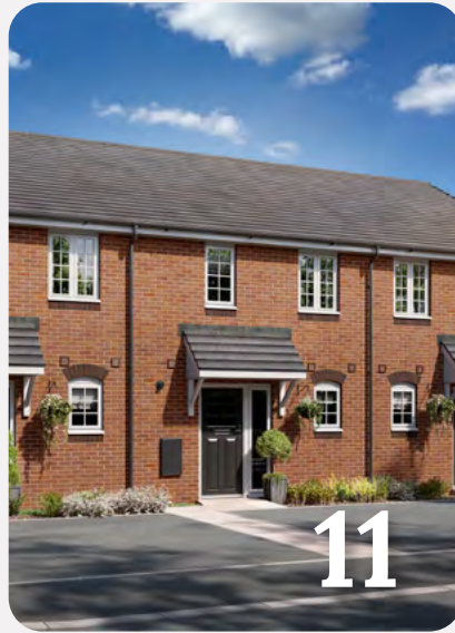
2 bedroom homes