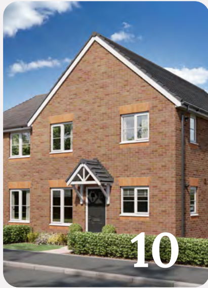
1 bedroom homes