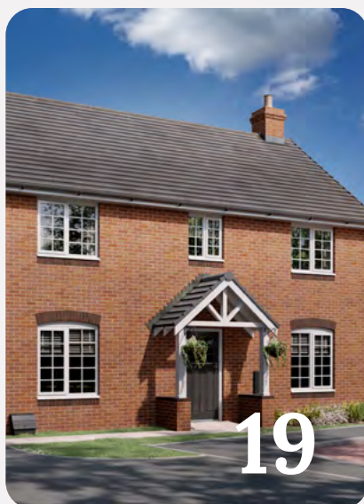
4 bedroom homes