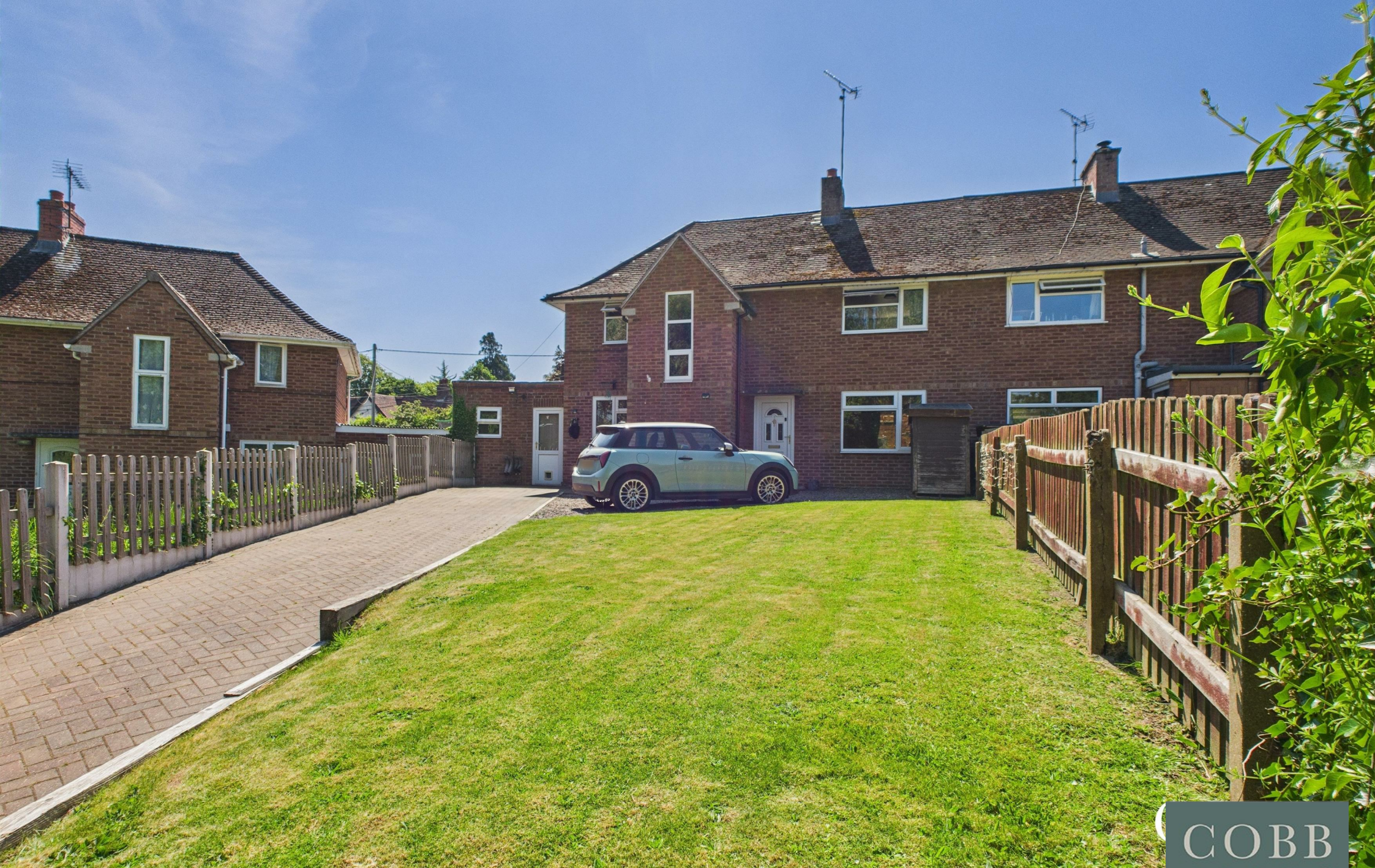
7 Baker Lea, Monkland, HR6 9DB Price £275,000