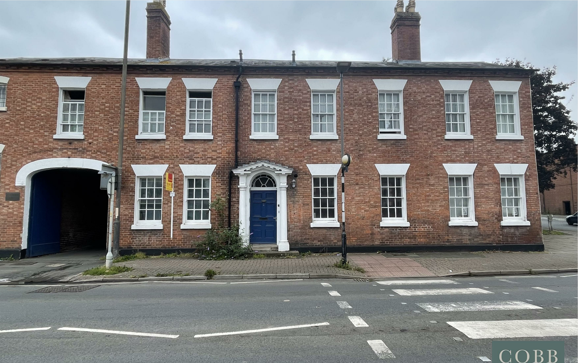
8 Carl Davis House, South Street, Leominster, HR6 8FG Offers Over £99,950