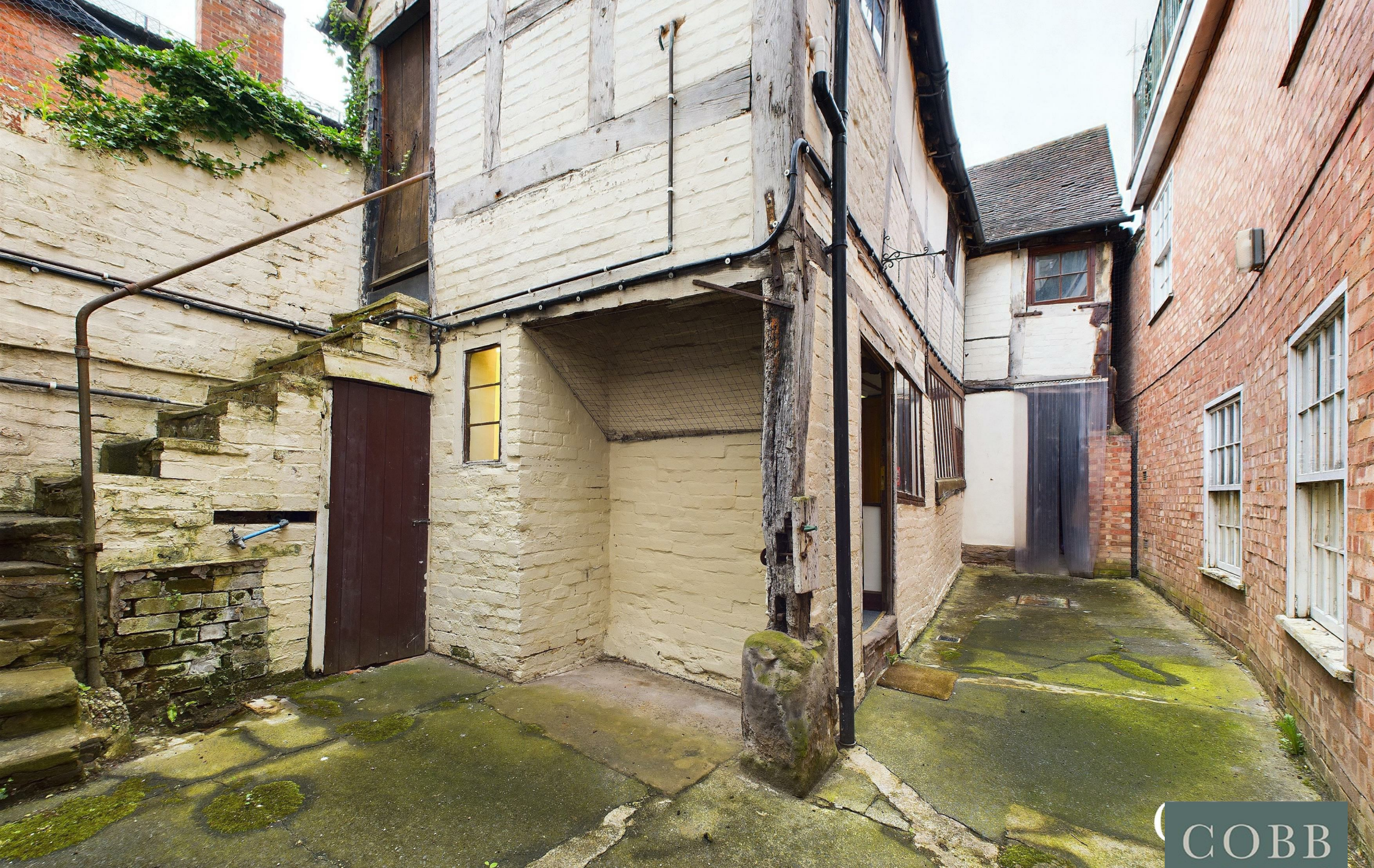
The Barn, 6a High Street, Leominster, HR6 8LZ Guide Price £120,000