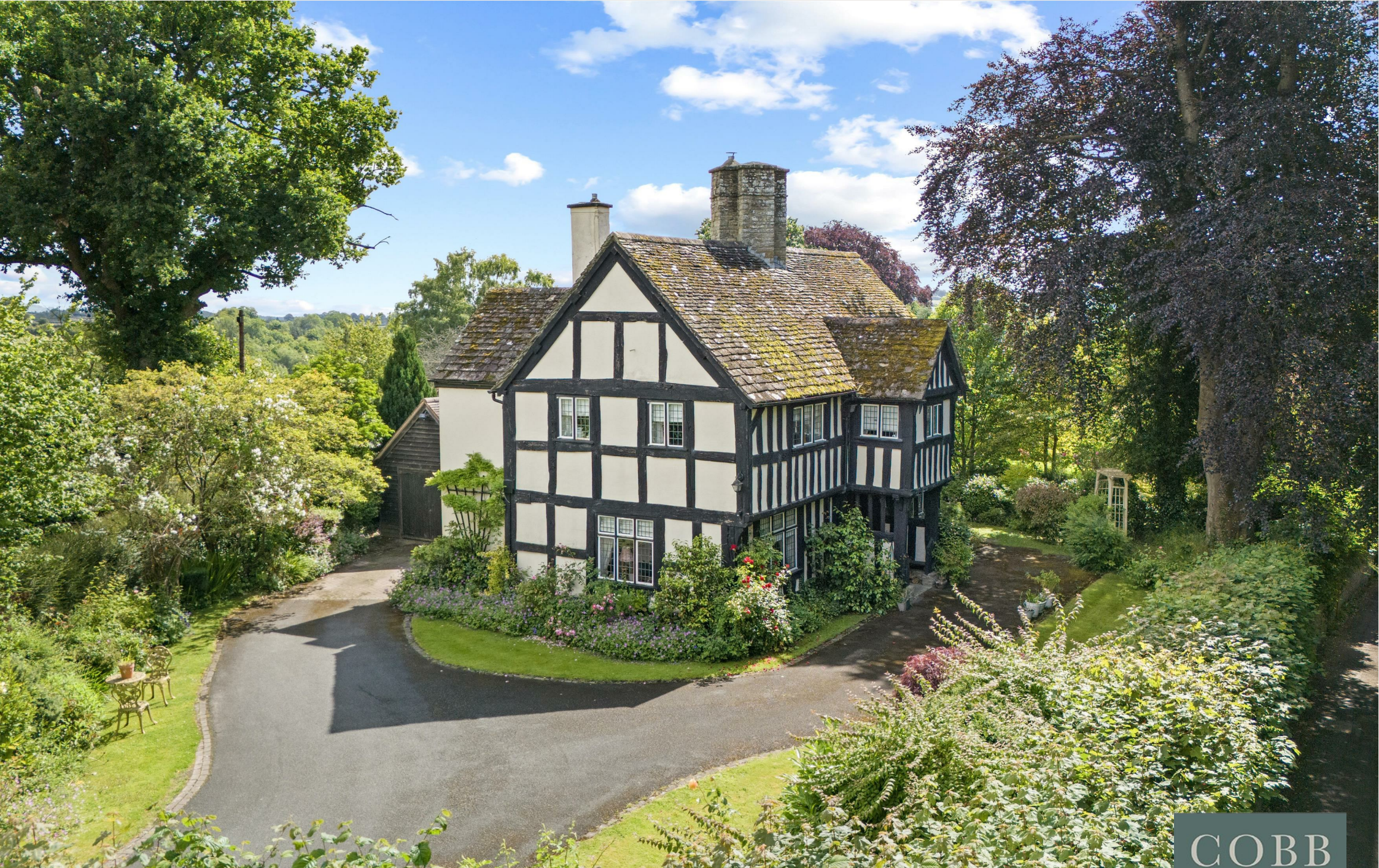
The Old House, 3, Church Road, Kington, HR5 3AG Price £525,000