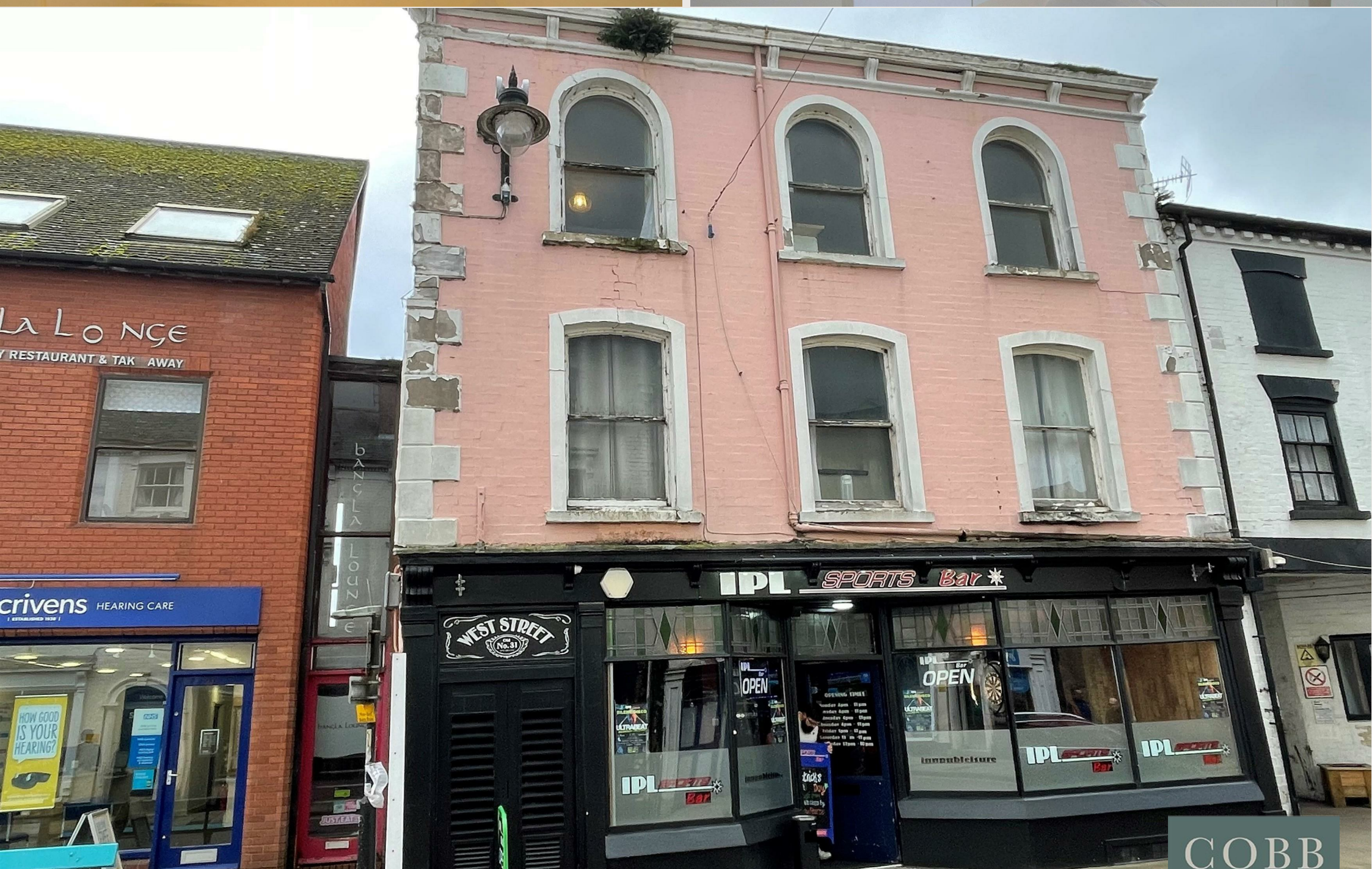
Flats 6 and 7, 29, West Street, Leominster, HR6 8EP Offers In The Region Of £105,000