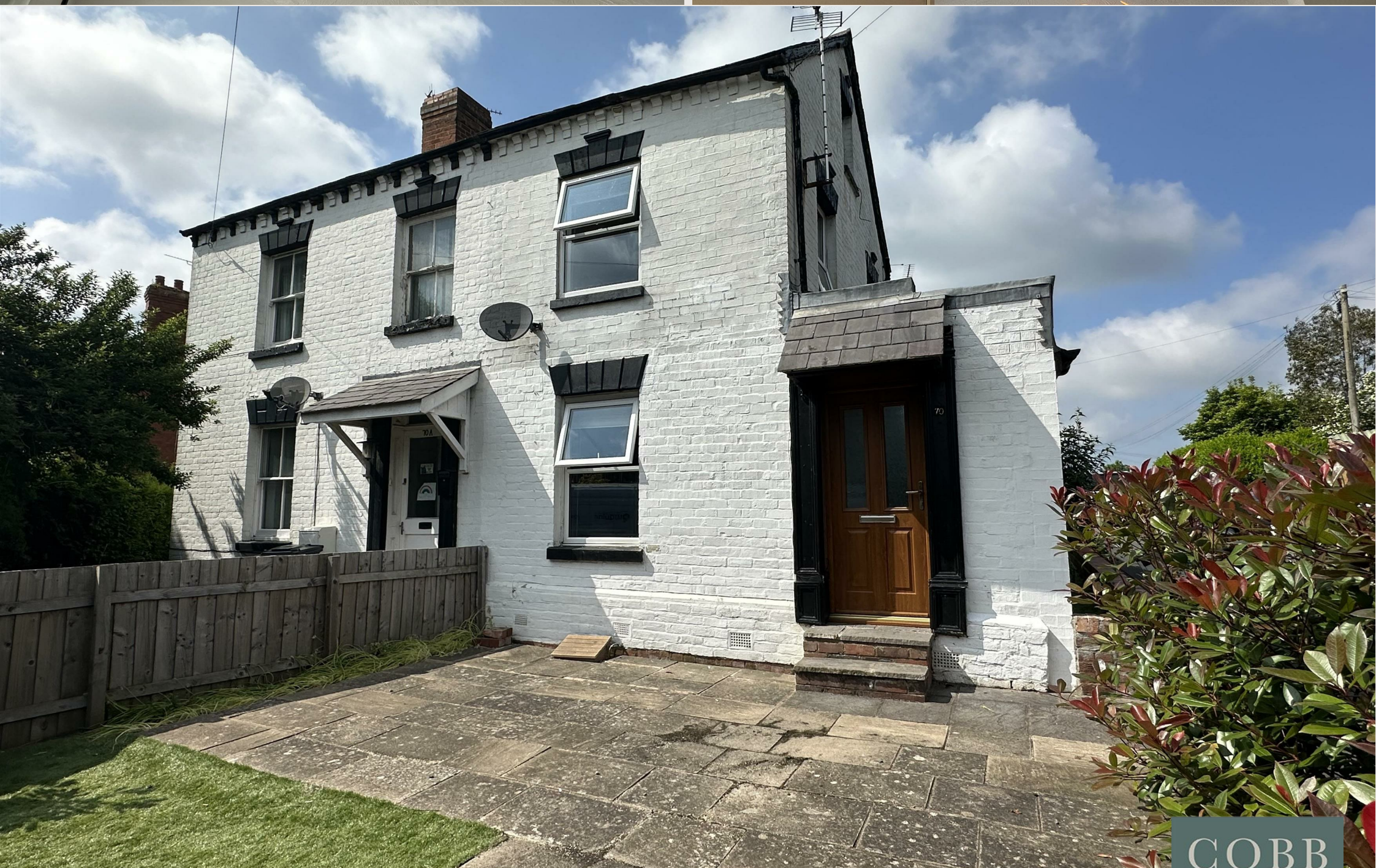
70, Bargates, Leominster, HR6 8QS Price £137,500