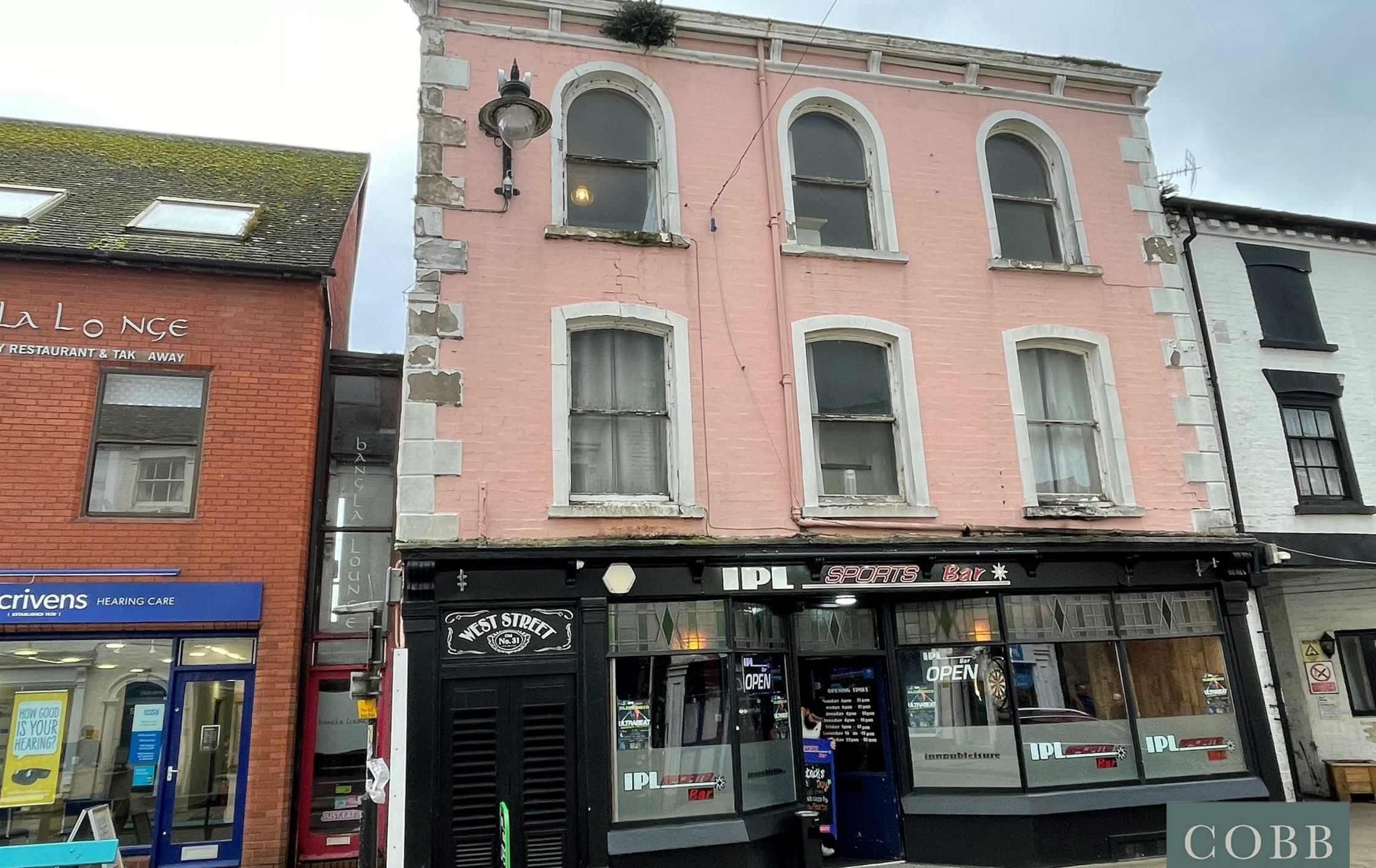
Flat 3, 29 West Street, Leominster, HR6 8EP Price £63,000