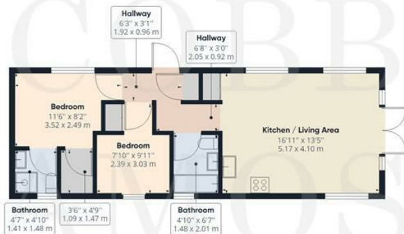
Ground Floor Building 3