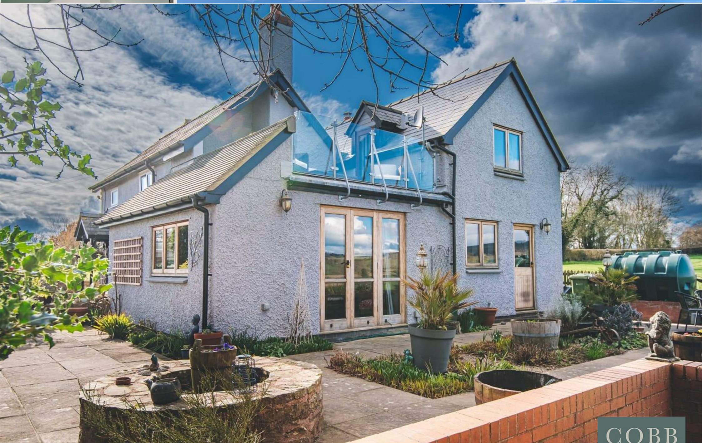
Well Cottage, Luston, HR6 0AS Offers In The Region Of £595,000