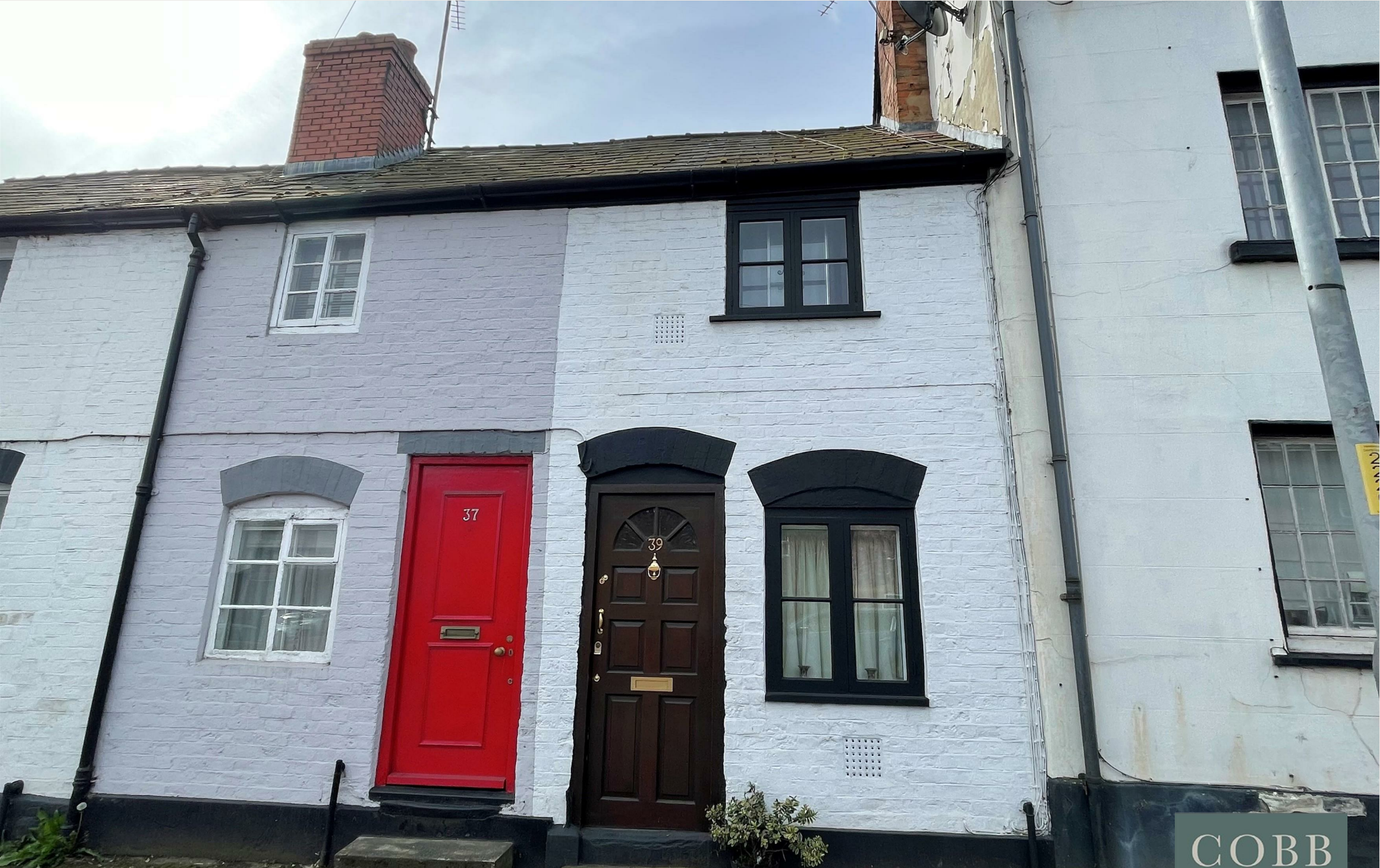
39, Bargates, Leominster, HR6 8EY Price £155,000