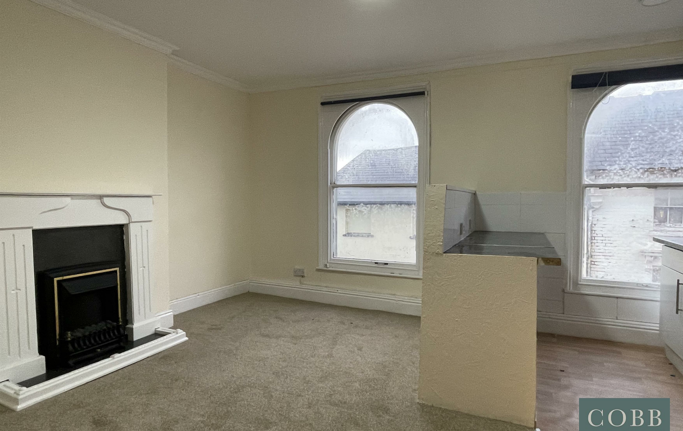
Flat 4, 29, West Street, Leominster, HR6 8EP Price £60,000