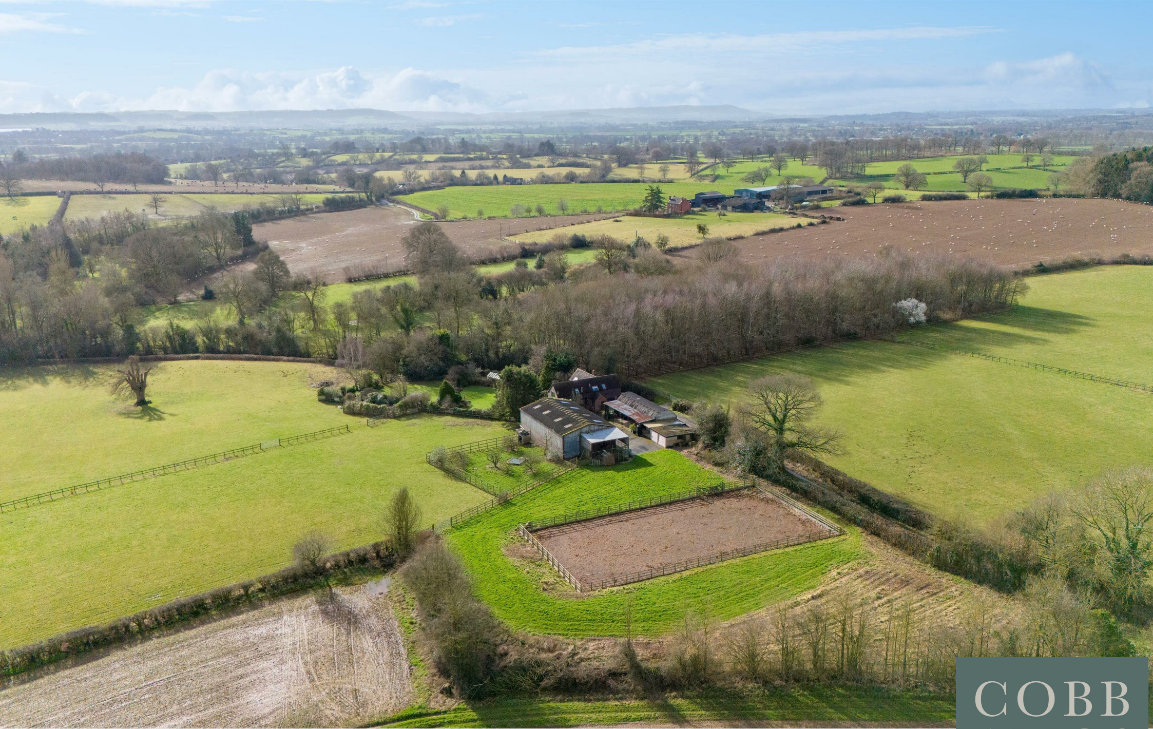
Englefield Croft, Eyton with approx 17 acres, HR6 9PS Price £1,150,000