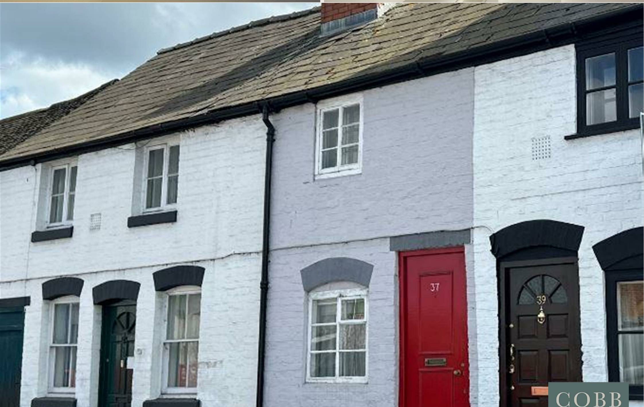
37, Bargates, Leominster, HR6 8EY Price £125,000