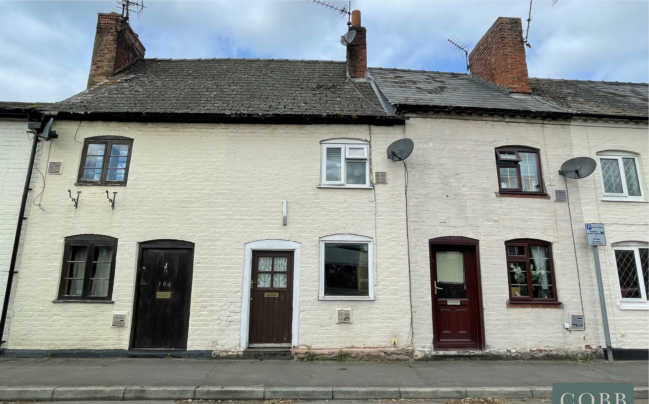
102, South Street, Leominster, HR6 8JF Price £135,000