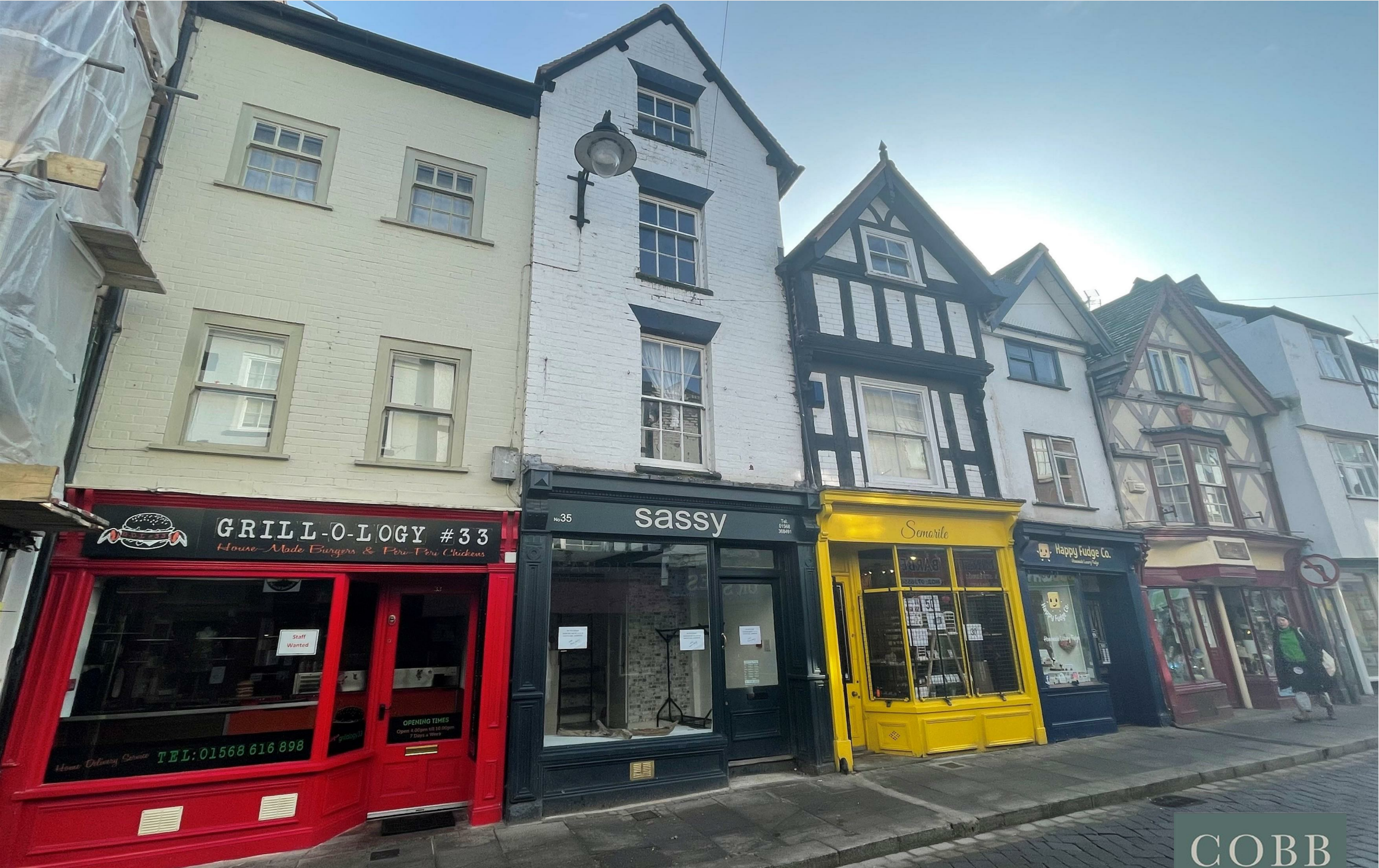
35, High Street, Leominster, HR6 8LZ Price £149,950